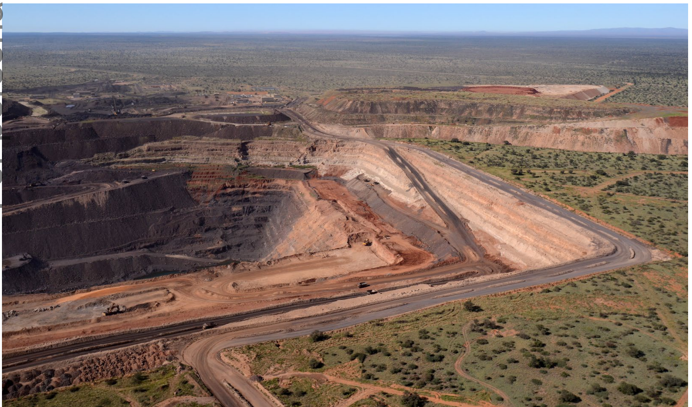
Figure 2: Tshipi Manganese Mine

Mining volumes improved compared to the prior comparative period, and ahead of current year plan, with Tshipi focusing on the depletion of the current cut and exposure of ore in the next cut, prior to the usual rainy season across December to February. Tshipi commenced the financial year with strong first quarter production volumes, which then moderated towards the end of the half-year period. Tshipi ceased production of low grade ore in October 2024 due to market conditions. Significant stockpiles remained at the end of December 2024.