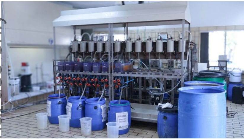
Figure 3: Jupiter Mines' HPMSM Pilot Plant

As part of Jupiter's strategy to investigate producing High-Purity Manganese Sulphate Monohydrate ( HPMSM ) for the EV battery market, the Company has established a Pilot Plant to conduct a thorough technical assessment and optimisation of the HPMSM flow sheet, building on insights from the initial scoping study 3 . The Pilot Plant replicates commercial operations, ensuring product quality through continuous sampling and consistent standards.