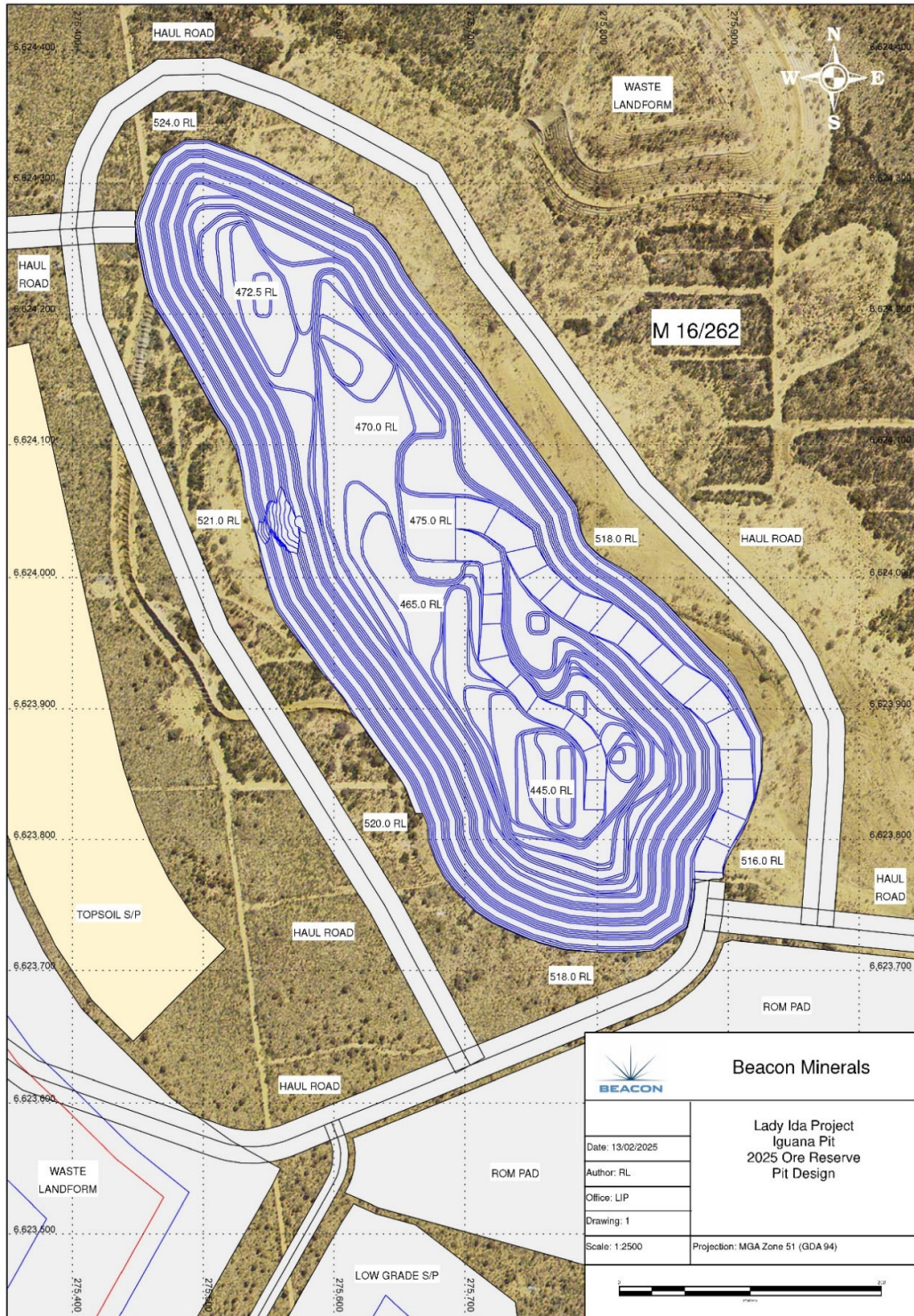
Figure 3: Iguana Detailed Pit design