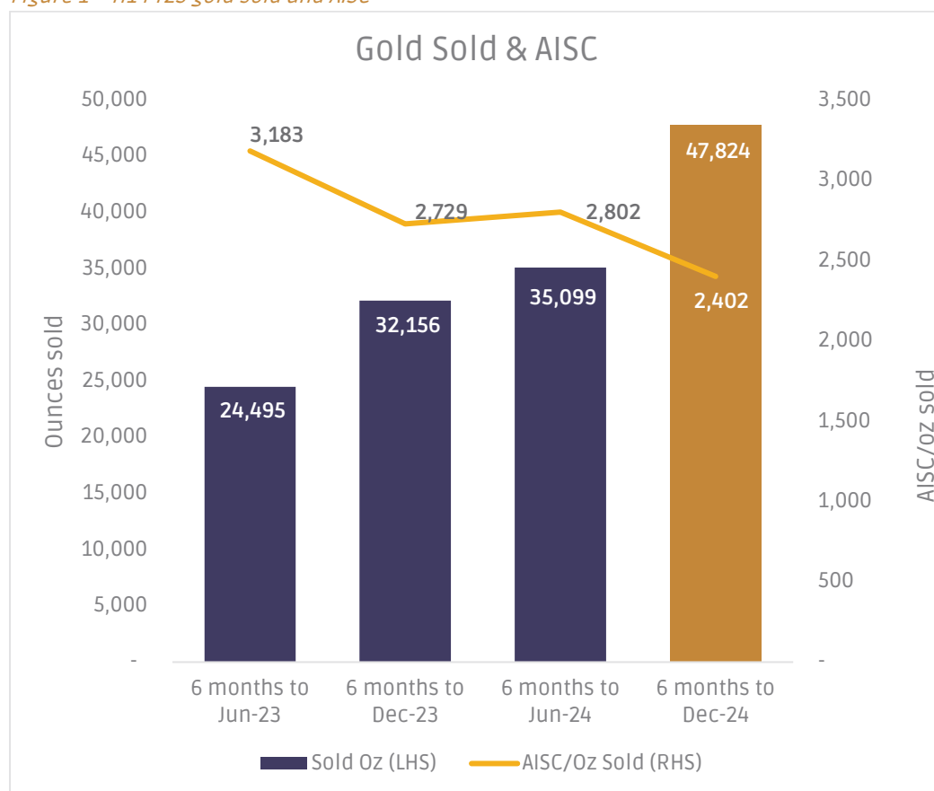
Figure 1 – H1 FY25 gold sold and AISC

The Group's improved performance over the last 12 months is reflected in the 254% increase in EBITDA to $84.2 million, driven by Riverina Underground delivering payback within 18 months of the portal being established and the increased gold price.