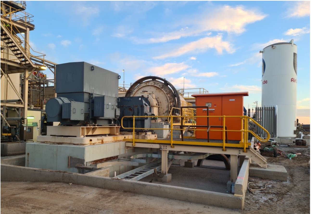
Figure 4: Secondary mill to provide future increases to throughput (yet to be tied into circuit)