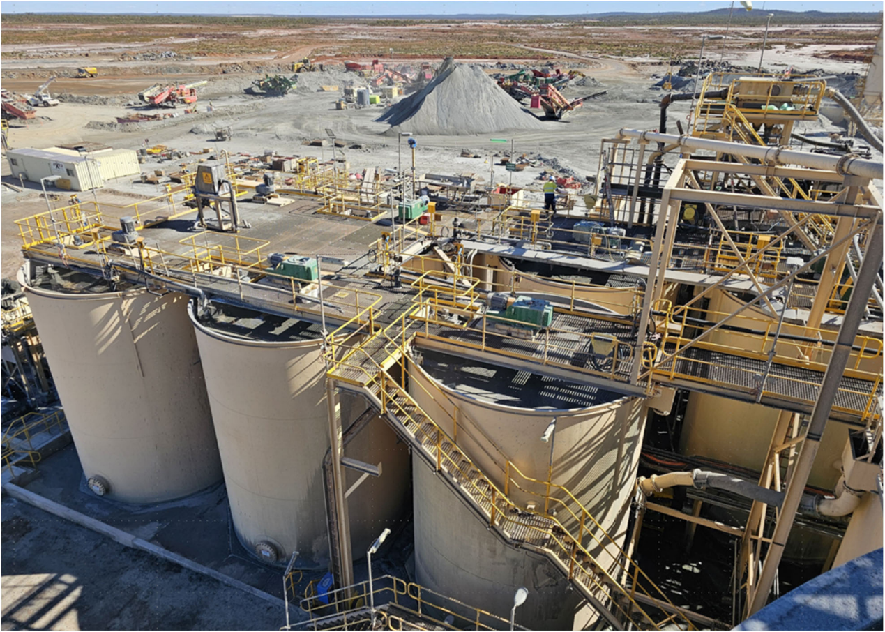
Figure 2: New CIL tanks were installed during 2023 to support an increase in throughput up to 1.2Mtpa.