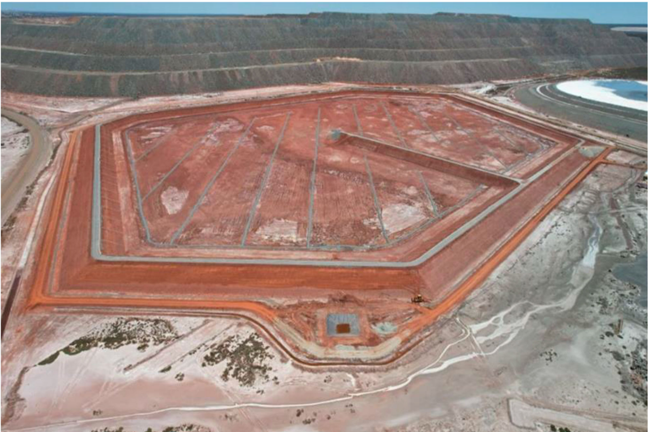
Figure 3: New tailings storage facility has now been commissioned.