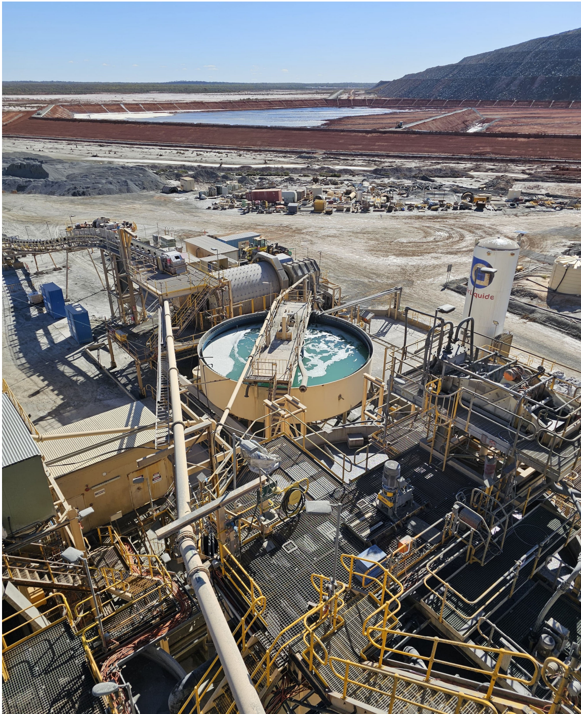
Figure 1: Lakewood processing facility.

In addition, and subject to completion, the engineering study to build the Kal East processing facility at Majestic has been concluded as it will no longer be required. In addition, the Company's already owned ball mills and supporting infrastructure will be retained. These mills will be held for potential installation/upgrade of the Company's various operations and projects, including the Coyote Gold Operation and the Mt Clement Antimony Project.