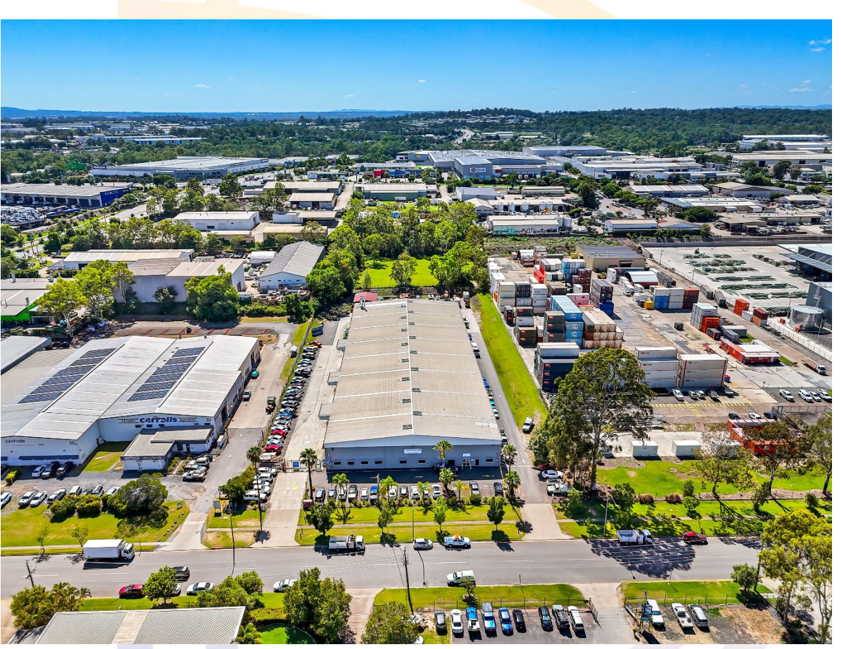
16 Industrial Avenue, Wacol (Brisbane)

Wacol is a core industrial suburb located only 20 km southwest of the Brisbane CBD with immediate access to major arterials, including the Ipswich and Logan Motorway. Brisbane Council houses their fleet vehicle maintenance division at the facility.