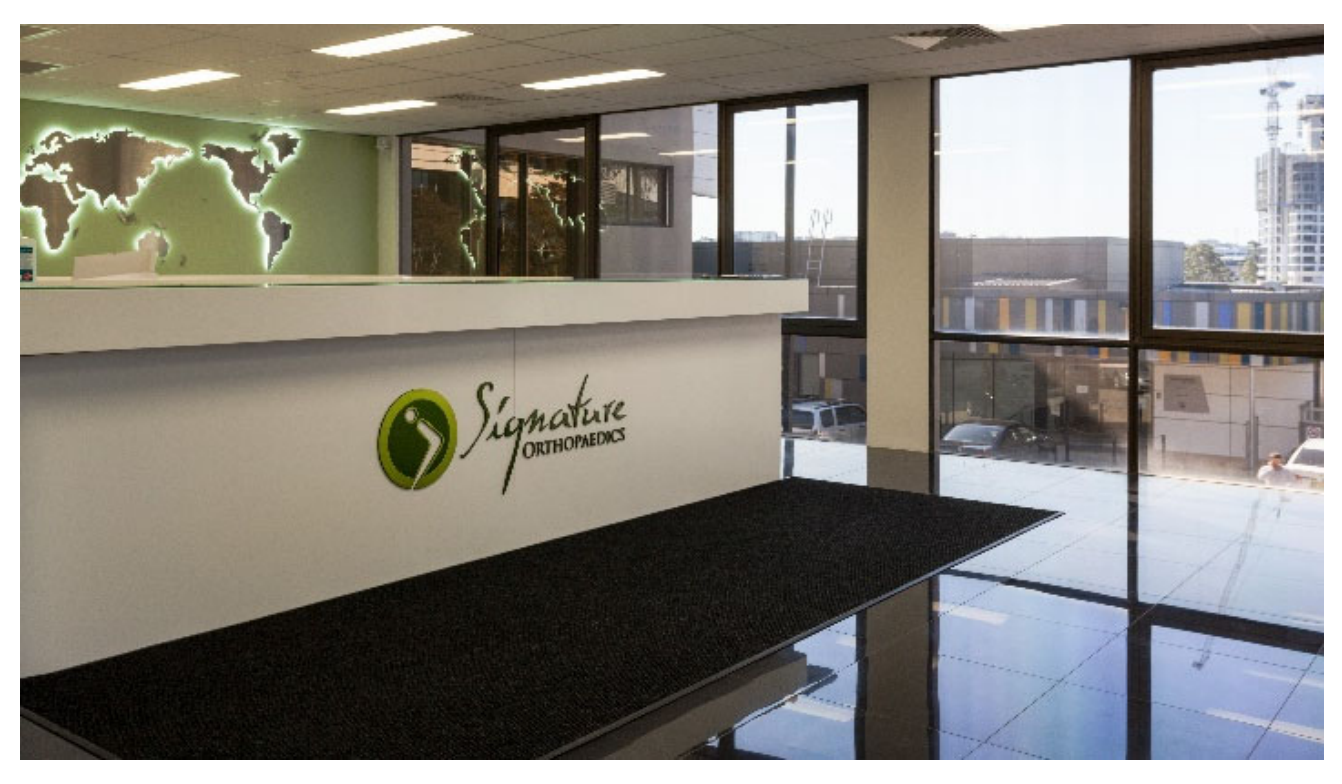
7 Sirius Road, Lane Cove NSW

The accompanying notes form part of these financial statements.