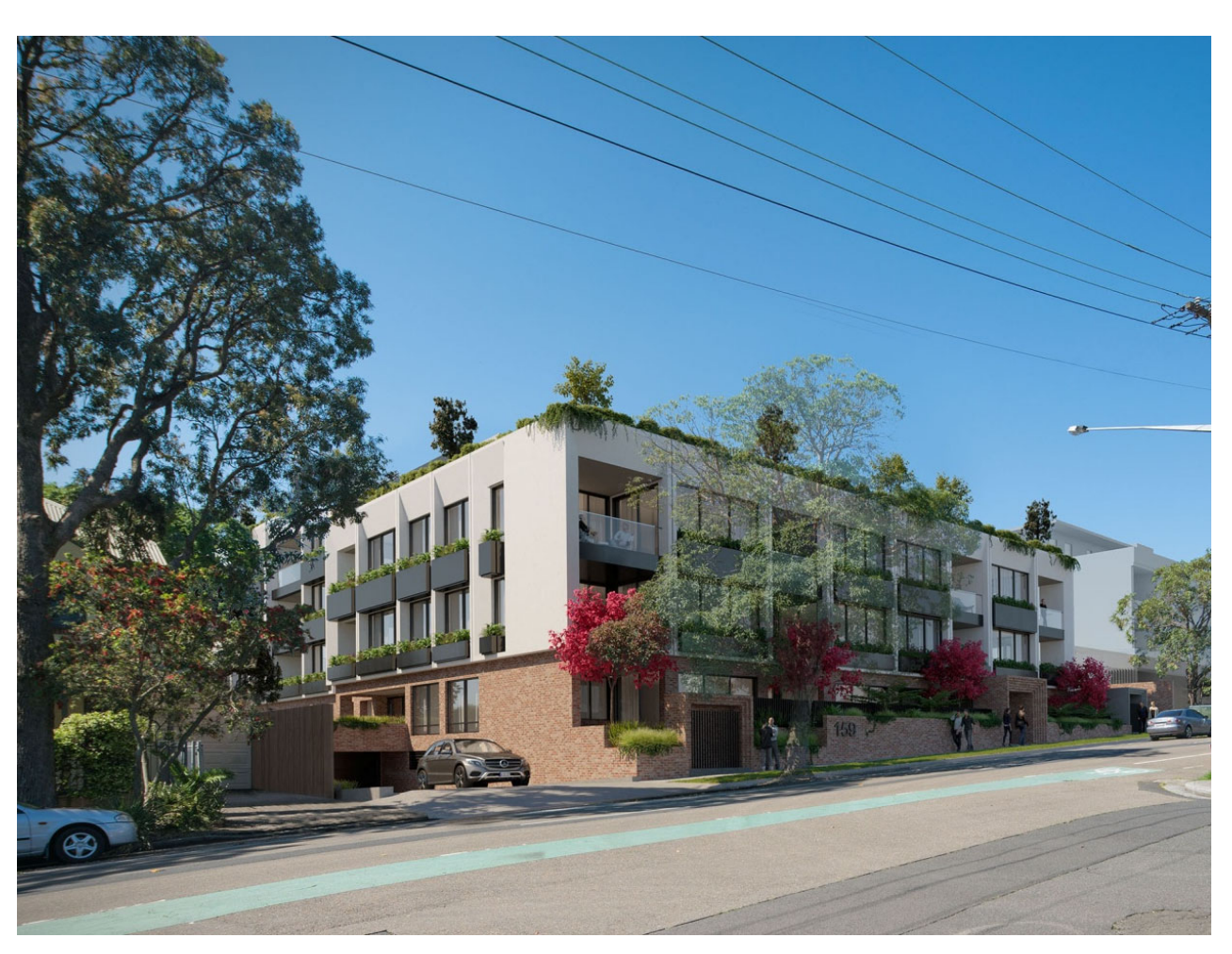
Concept image – 159 Allen Street, Leichhardt NSW