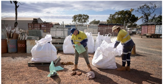
DFS Activities during the half year, included significant progress on the RC Infill drilling program. The data will be used to upgrade nickel-cobalt laterite mineral resource, with the aim to upgrade to Measured category for the first 5-year open pits.