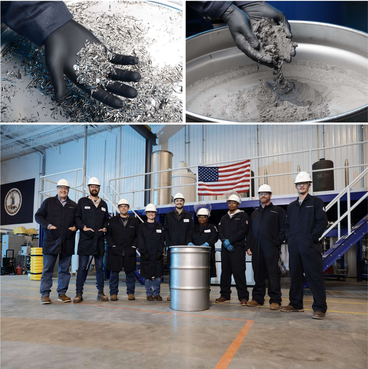
Figure 1 (clockwise from top left): Titanium scrap; Finished titanium metal powder; IperionX metal production team with a drum of finished titanium metal powder in front of the HAMR furnace at the Titanium Production Facility.

Progressive commissioning of the Virginia facility continued apace in preparation for routine titanium production cycles. Multiple process improvements were identified that are expected to increase titanium production capacity beyond nameplate levels by late 2025.