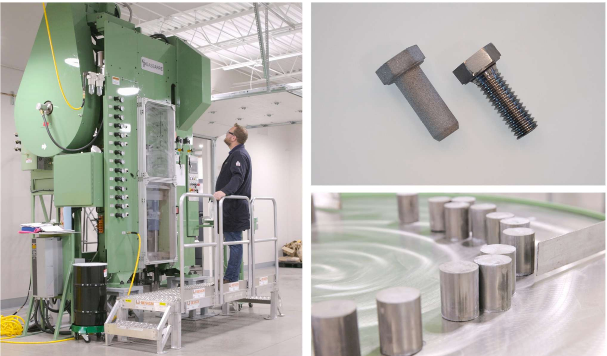
Figure 3 (clockwise from left): 100 ton uniaxial hydraulic press operations; Pre-HSPT fastener (LHS) and post- HSPT and threaded fastener (RHS); Pre-HSPT bars / pucks.

IperionX continued to add and commission critical equipment at its Advanced Manufacturing Center in Virginia where it uses the high-quality titanium powders produced at the Titanium Production Facility to manufacture a range of titanium products including semi-finished traditional mill products, near-net-shape forged titanium components, and titanium products using the ground-breaking, patented HSPT process.