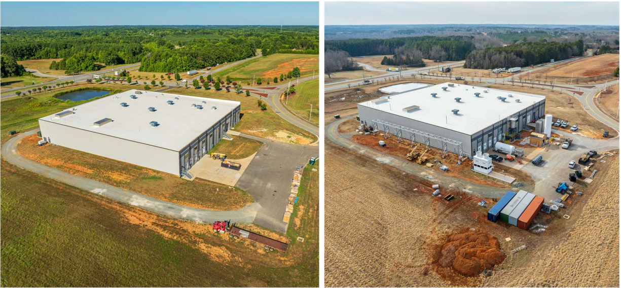
Figure 2: Development activity in July 2024 (LHS) compared to January 2025 (RHS), with external infrastructure installed, including argon storage tank & vaporizers, jet mill bag house and cooling water towers.