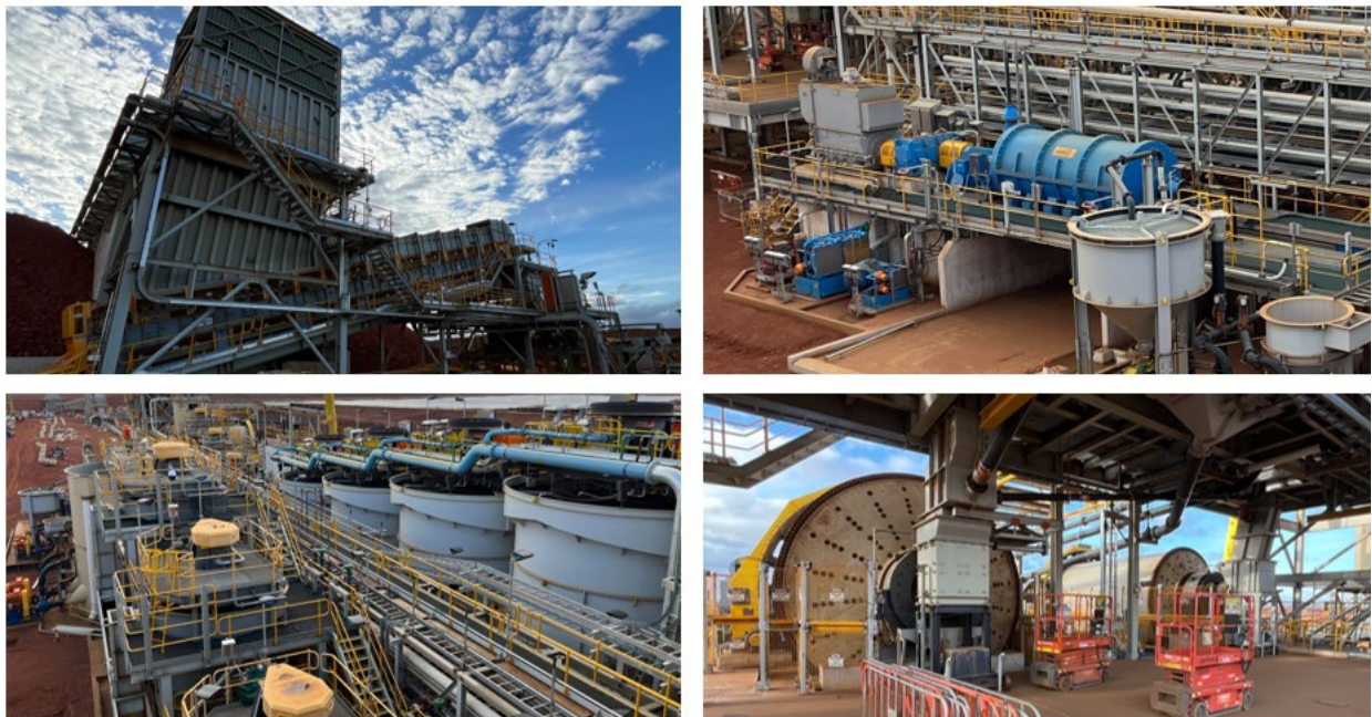
Stage 2 Circuits: Crusher, Regrind Mil, Flotation, SAG & Ball Mills

Construction of the Hybrid Power Station is progressing as planned. Gas bullets have been placed on site and the gas generators have been installed. Operation of the gas power generation assets is planned from March. Earthworks for the solar farm commenced and the solar panels are planned to be delivered to site this quarter.