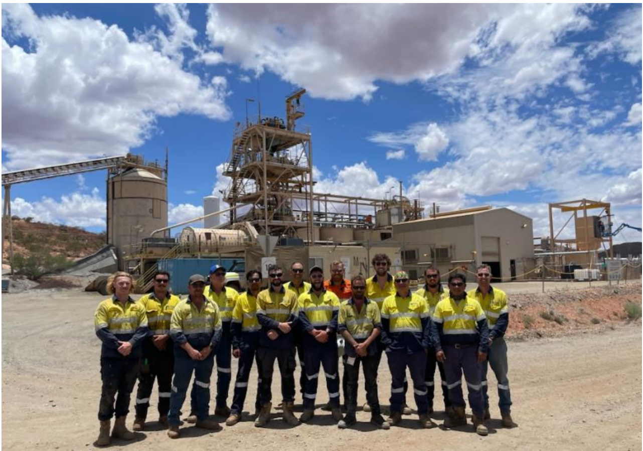
Figure 2: BC8 staff and final members of Maca Interquip prior to demobilising from site.

The Paulsens Team, combined with Maca Interquip have successfully refurbished the process plant, and returned the mine to functional operation. All of this has been completed on time and within budget.