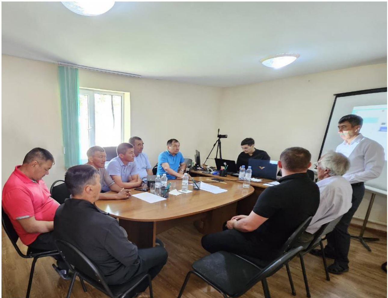
Figure 2 - Public Environmental Hearing in September 2024

The environmental permit has been informed by three public environmental review hearings held in nearby villages who have all been very supportive of the project (Figure 2).