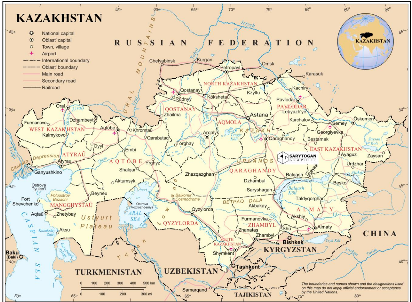
Figure 3 - Sarytogan Graphite Deposit location.

The Sarytogan Graphite Deposit is in the Karaganda region of Central Kazakhstan. It is 190km by highway from the industrial city of Karaganda, the 4th largest city in Kazakhstan (Figure 3).