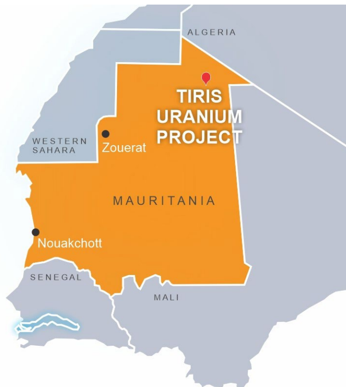
Figure 2: Location plan of the Tiris Uranium project in Mauritania, Africa

Tiris is located approximately 1,400 kilometres from the capital of Mauritania, Nouakchott. The Project is located 680km from the town of Zouérat in the Tiris Zemmour Region of Mauritania. Access is by hard pan desert track (Figure 2).