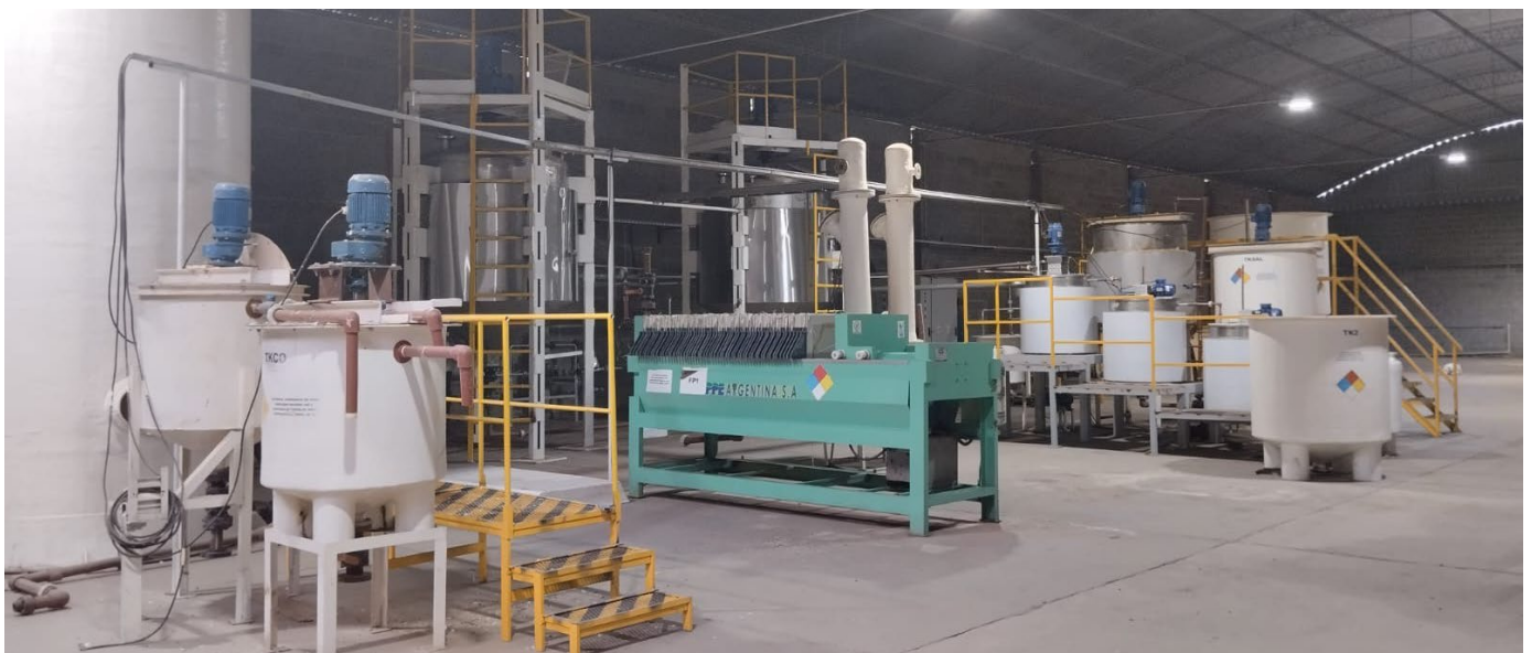
Figure 1 – 250tpa Lithium Carbonate Pilot Plant in Salta, Argentina.

The Company is progressing with its commissioning and start up works of the Lithium Carbonate Pilot Plant (“ Plant ”). The Plant is in the final stages of commissioning the initial processing circuit with recent completion of the boiler installation along with the centrifuge and other final components to begin processing lithium brine.