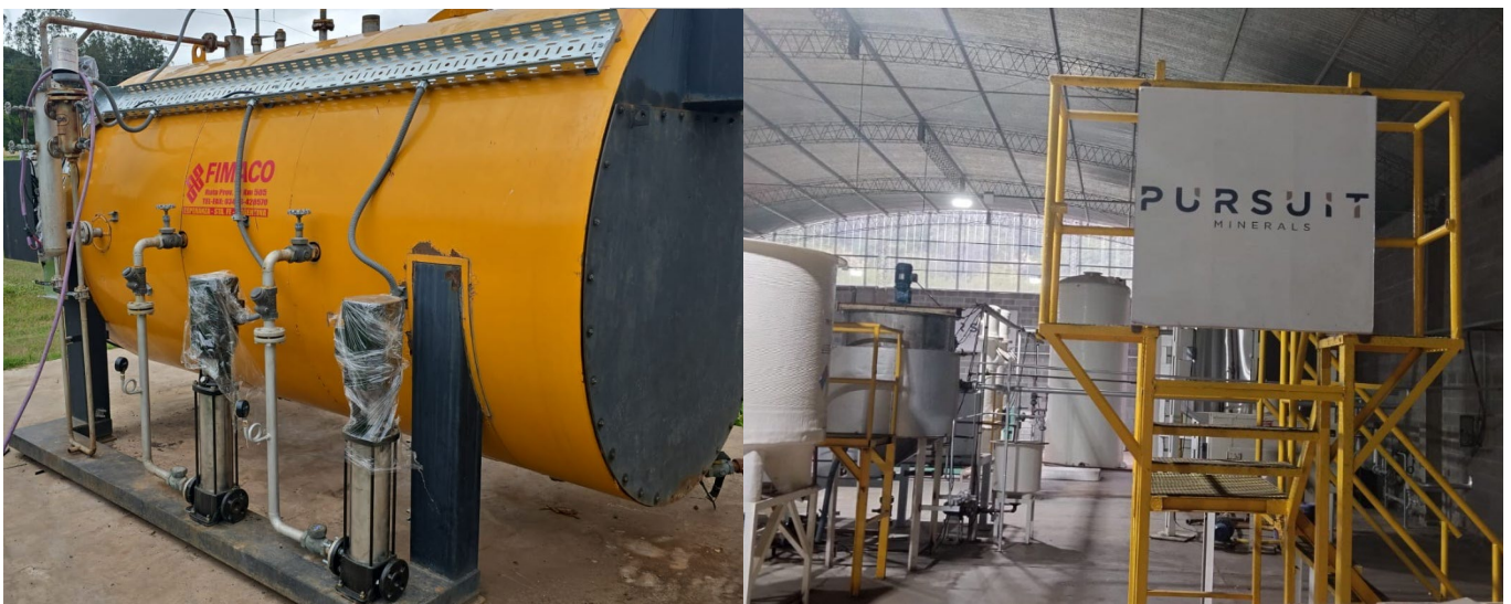
Figure 2 – The boiler installed at the 250tpa Lithium Carbonate Plant in Salta.

The Salta facility is being designed for seamless replication at the Rio Grande site, with extensive testing and optimisation conducted in Salta before relocation. Once moved, the plant will enable continuous processing under on site conditions technically de-risking future larger scale plants, following the successful initial production of Lithium Carbonate in Salta. The Sal Rio 2 tenement has been selected for the location of the evaporation ponds and Plant due to its topographical characteristics and superior evaporation rates. The construction of the ponds is subject to environmental approvals by the Salta Mining Secretary, other relevant government stakeholders and Pursuit board approval.