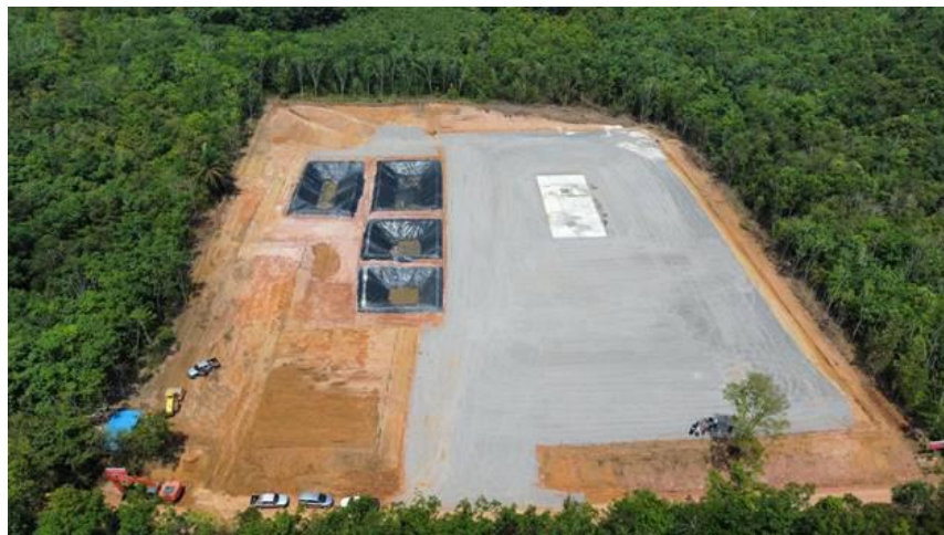
Figure 2: Bunian 6 Well pad

The well pad construction is complete and the flowline has been laid to the edge of the location. The well pad can accommodate at least two wells which will shorten lead times for future drilling considerably. Bass is currently confirming drilling rig availability to lock in a spud date.