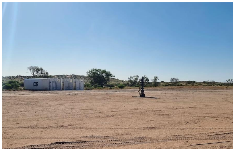
Figure 1: Kiwi 1 Wellsite post EPT

The result of the EPT has confirmed Bass' view that Kiwi has significant economic value. For further details please refer to the ASX release dated 8 November 2024.