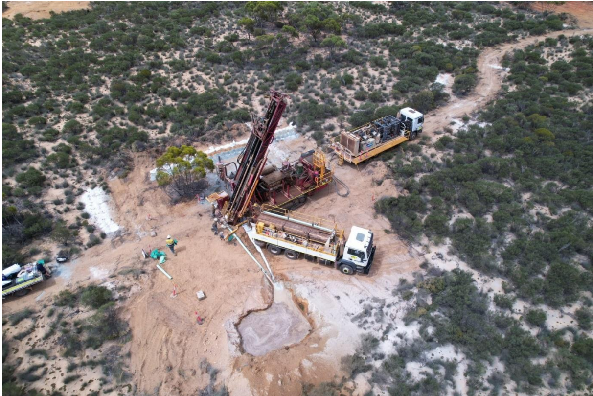
Phase 3 RC drilling at the Louie Prospect

The samples collected during the campaign have been submitted for assay in Perth, with results expected early next year. The Company remains on track to commence aircore drilling in January/February 2025, a program designed to test ~8km of highly prospective, untested strike.