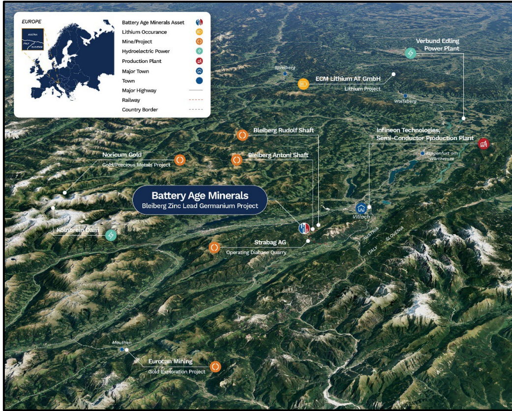
Figure 1: Bleiberg Zinc Lead Germanium Project located in the state of Carinthia, Austria.