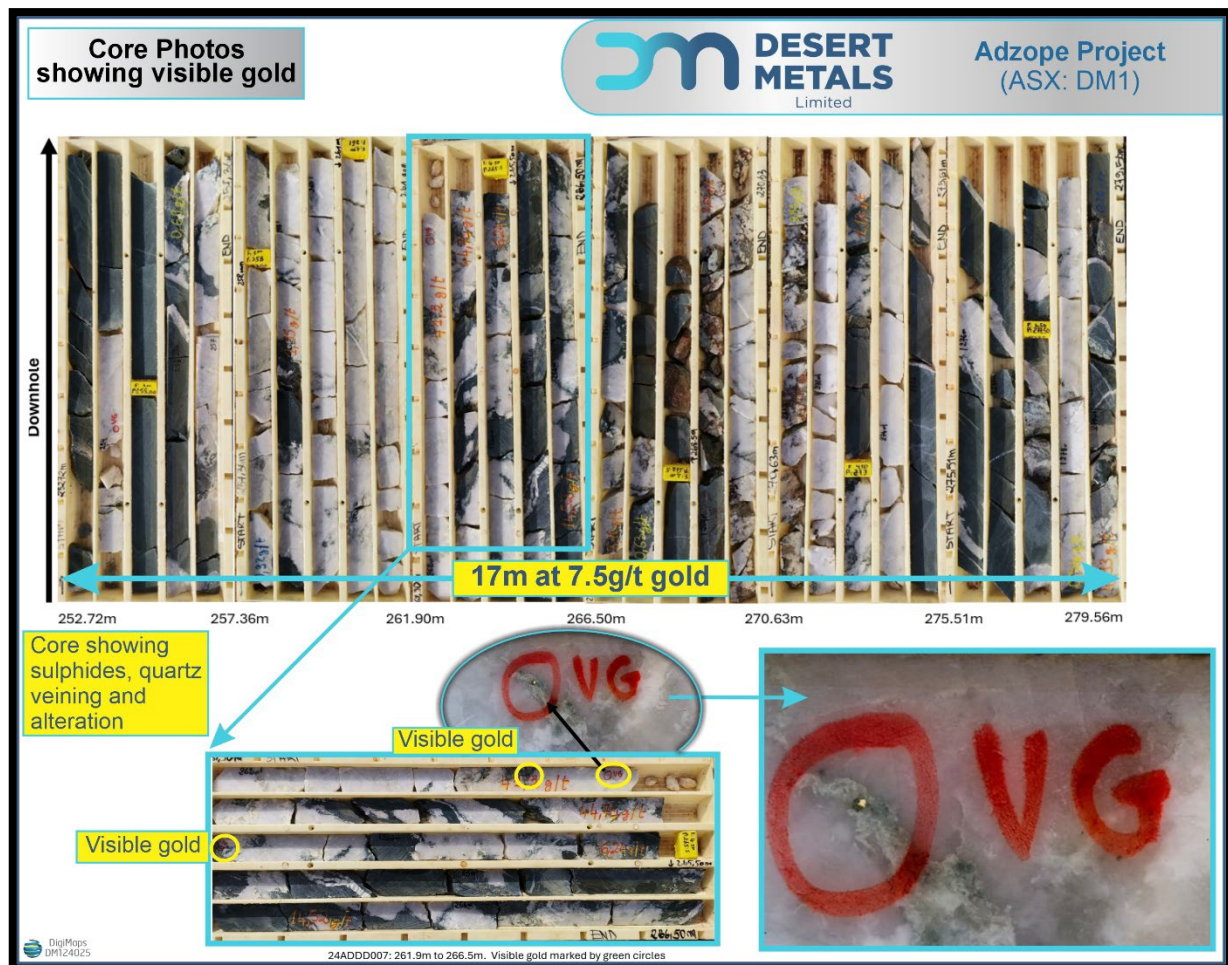
Figure 2 – Hole 24ADDD007 7 252.72m to 279.56m including visible gold