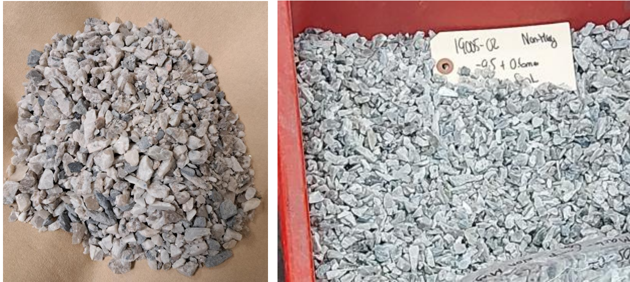
Figure 2: Crushed whole rock pegmatite with 15% non-pegmatite host rock dilution – 1.05% \text{Li}_2\text{O} (left); DMS spodumene concentrate feed for the downstream test work – 6.2% \text{Li}_2\text{O} and 0.60% \text{Fe}_2\text{O}_3 (right).

The spodumene concentrate was produced using a simple DMS-only (+ magnetic separation) flowsheet which was fed by a master-composite of drill core material, representing anticipated early mine-life (Figure 2). This master composite included 15% non-pegmatite host-rock dilution to better represent a conservative (in terms of dilution content) commercial mining operation scenario.