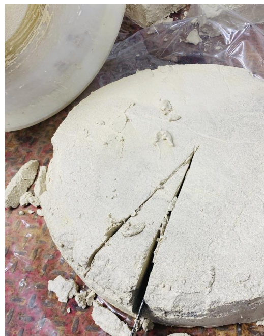
Figure 4: Filtering stage and resultant filter cake post water-leaching and impurity removal.