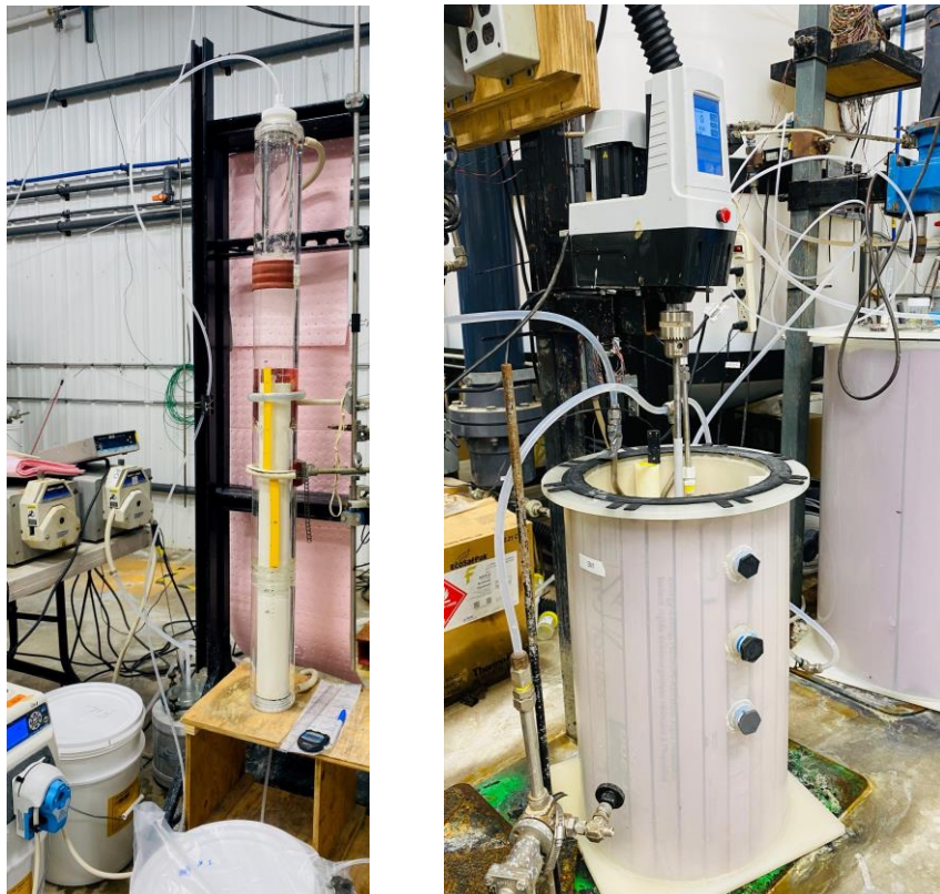
Figure 3: Water-leach and ion exchange impurity removal stages of the lithium hydroxide flowsheet.

The Company has recently completed a significant core sampling program to provide additional representative material for the next phase of mineral processing testwork in support of the ongoing Feasibility Study on the CV5 Spodumene Pegmatite. This program will provide significant quantities of representative spodumene concentrate for any future downstream test programs.