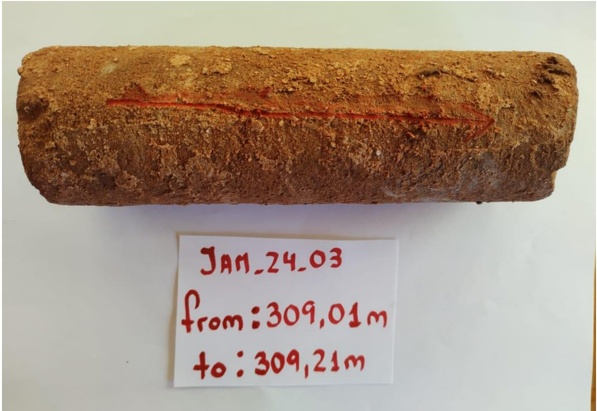
Figure 1. Core 10 showing sandy matrix with reddish brown clay transition.