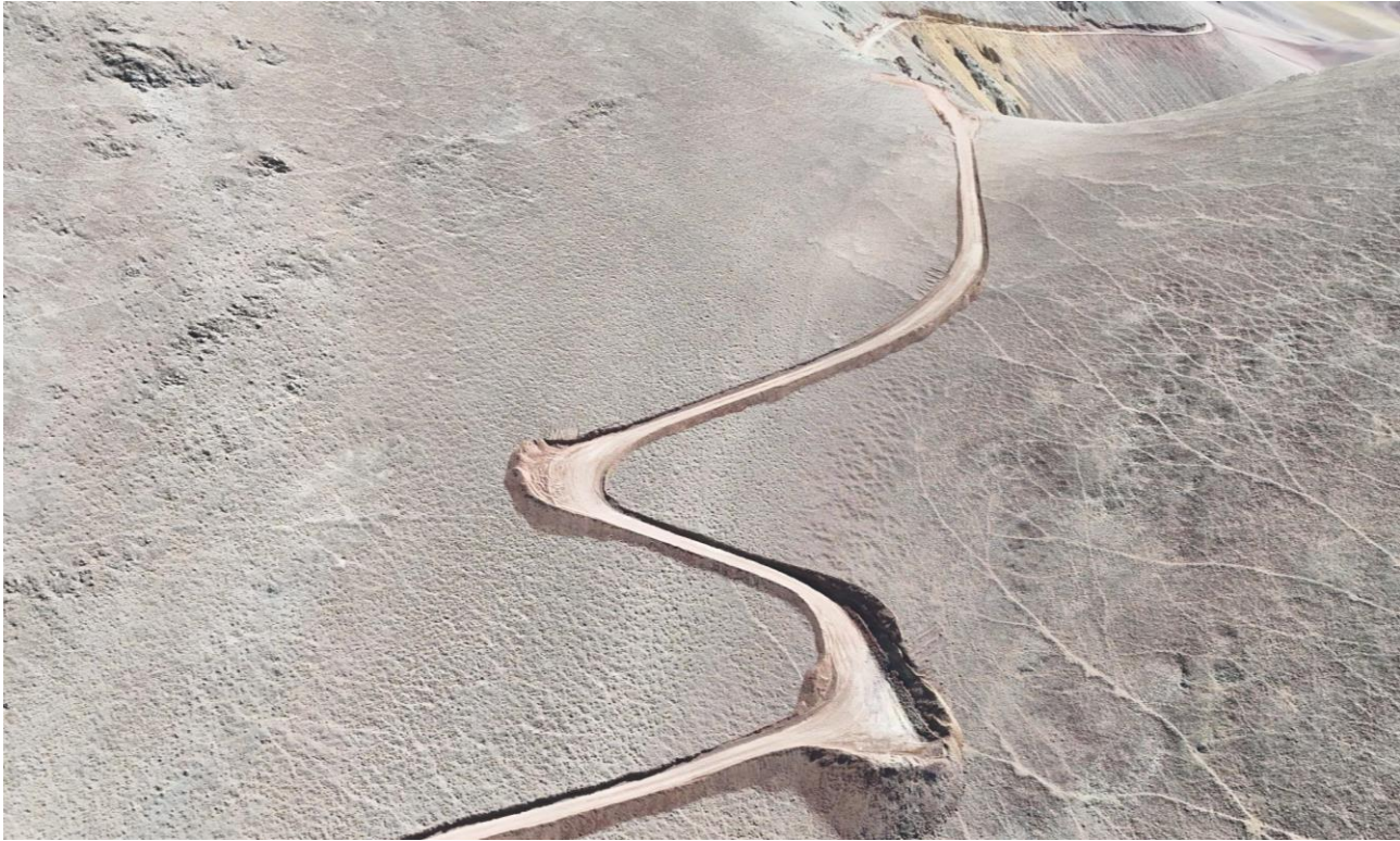
Figure 1 - Section of the newly constructed access track to Malambo drill targets.