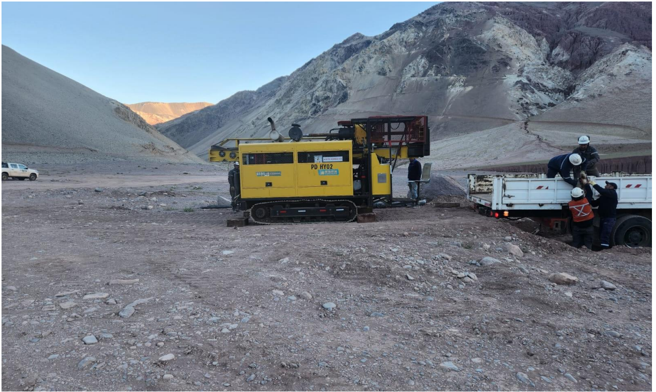
Figure 3 - Arrival of the first of Conosur's drill rigs at the TMT project.