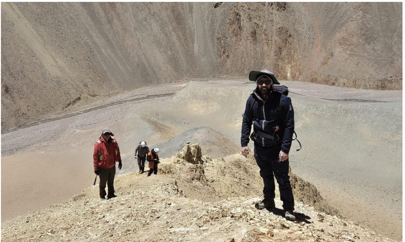
Figure 4 – Regional team at the Malambo target.