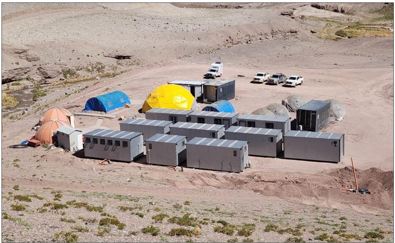
Figure 5 - TMT Camp is now ready for 55 persons fully furnished.