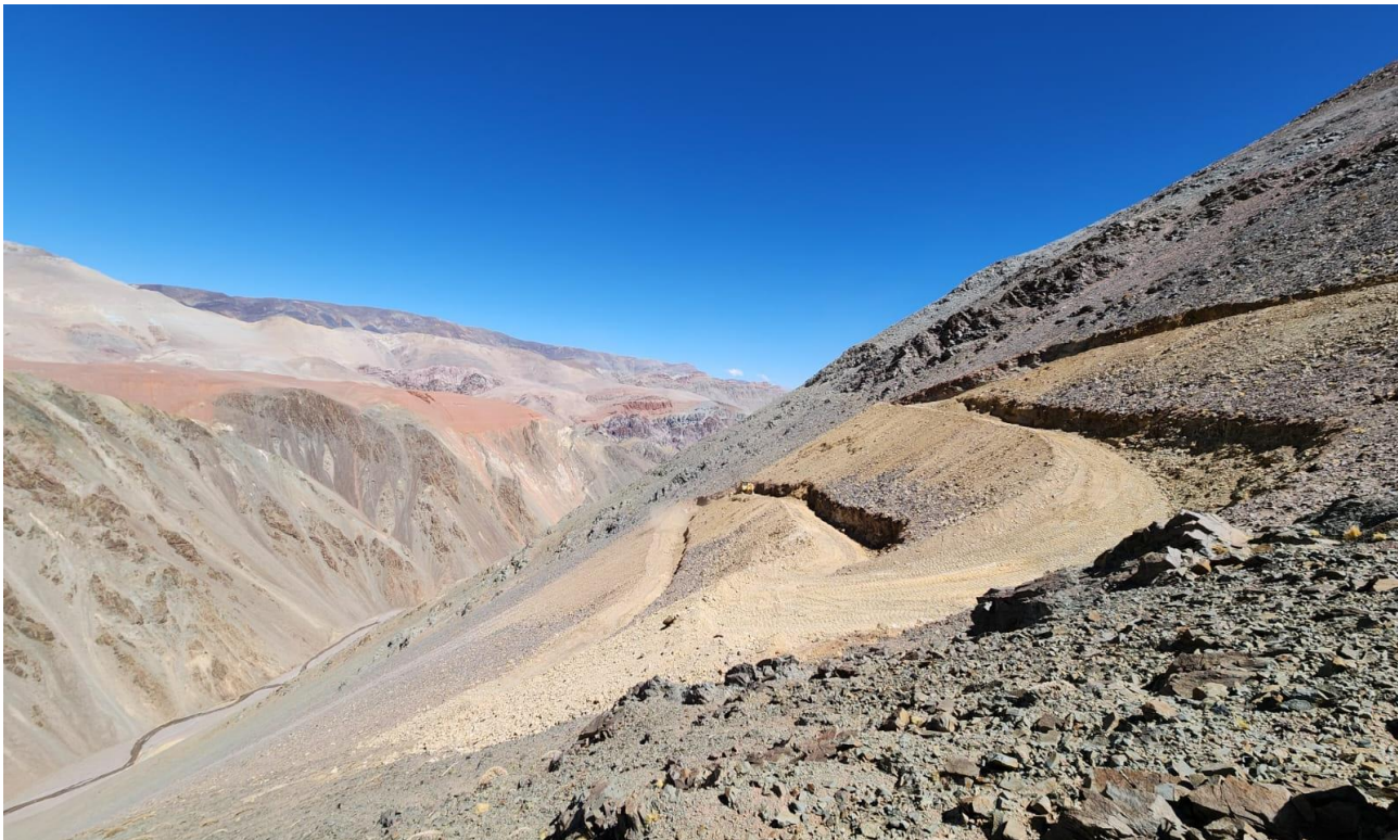
Figure 2 - Malambo access track through one of the rocky sections.