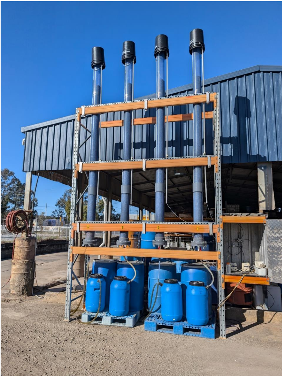
Figure 1: Four column leach test configuration

Preliminary testing of specific characteristics such as mineralogy, acid consumption, particle size distribution and abrasion index was initially carried out to provide data and design criteria for Front-End Engineering Design ( FEED ). These results also provided the inputs to the subsequent leaching testwork program that has been undertaken.