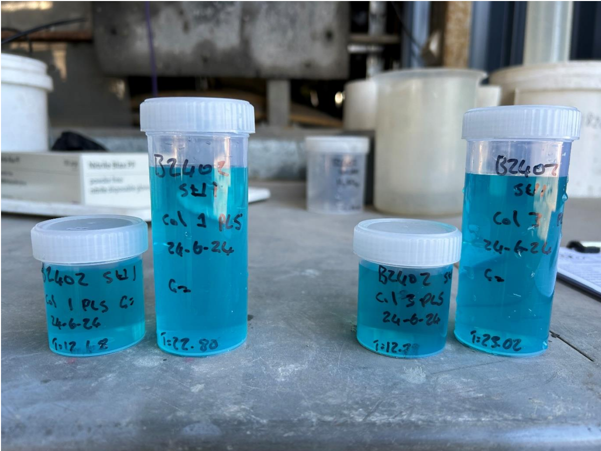
Figure 3: Pregnant leach solution obtained from column leach testwork

The results achieved indicate that the oxide and transition ore from the Dianne Deposit responds well to conventional leaching reagents, or lixiviants, such as sulphuric acid and iron. Sulphuric acid plays a key role in the leaching of oxide minerals, whilst iron assists the reactions responsible for leaching of transitional type minerals.