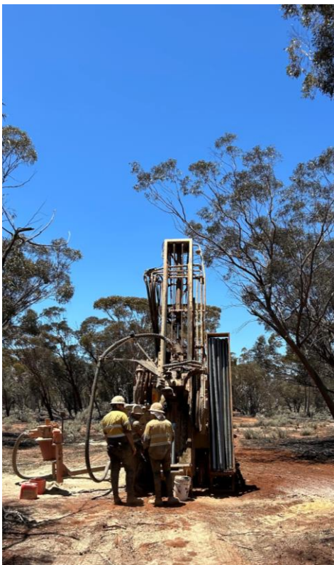
Aircore drilling currently underway at the Koolyanobbing Metals Project

The Golden Wishbone Target consists of a 650m strike length gold in soil anomaly lying at the northern end of the 8km gold trend. The target encompasses the abandoned 1930's Golden Wishbone mineshaft with reported production of 204 ounces from 344 tonnes giving an average grade of 18g/t from a single quartz vein 3 . Whilst several historic surface prospecting trenches have been constructed in the area, the public record suggests no modern exploration has been undertaken. During September 2024 a four hole, 413m RC program was completed testing the central part of the gold target.