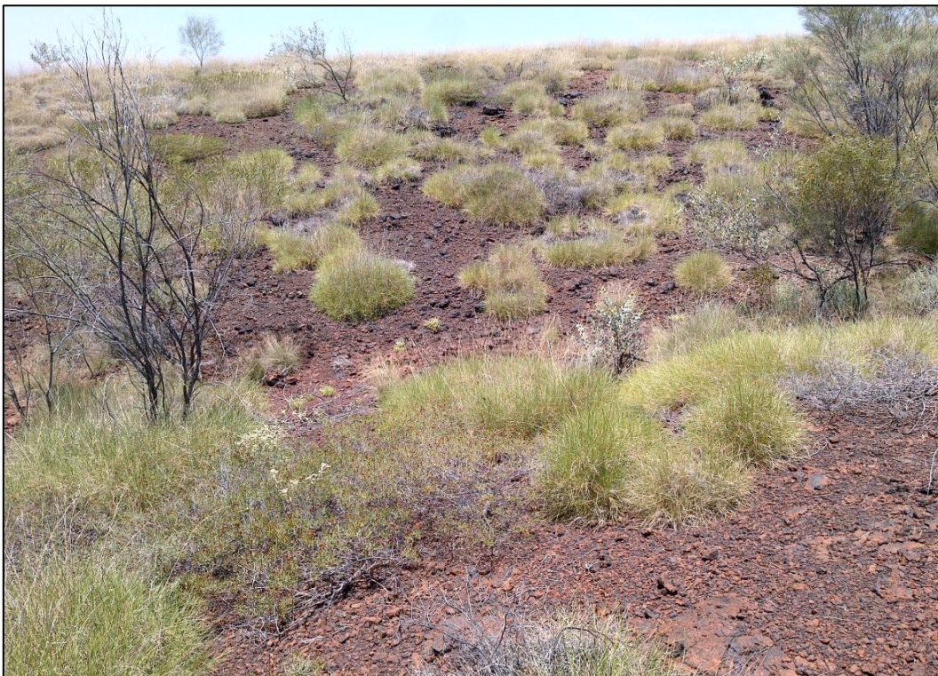
Figure 5. A gully from the northern manganese corridor exposing widespread manganese outcrop (looking south west). Located north of sample WDRC036 – 42.3% Mn (pXRF). Refer to Figure 1 for the location