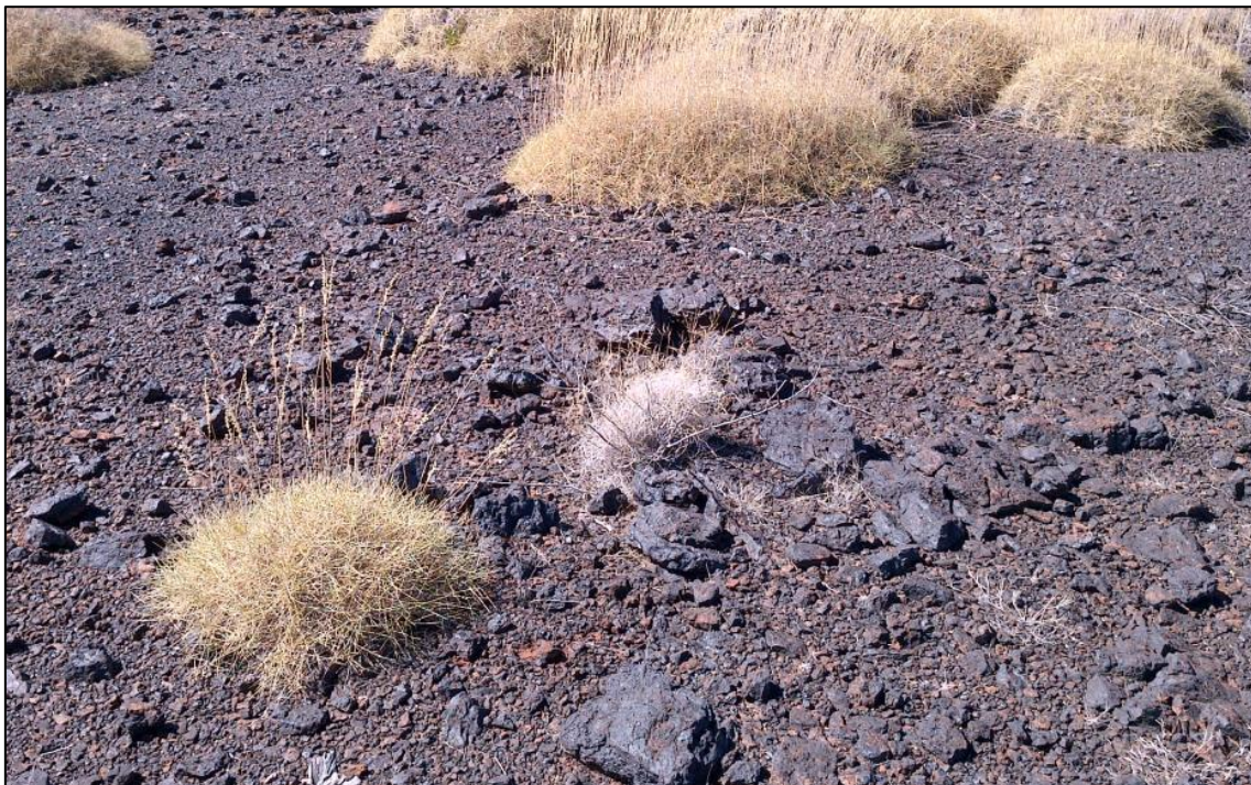
Figure 3. Outcrops associated with sample WDRC002 – 58% Mn 1 . Refer to Figure 1 for the location