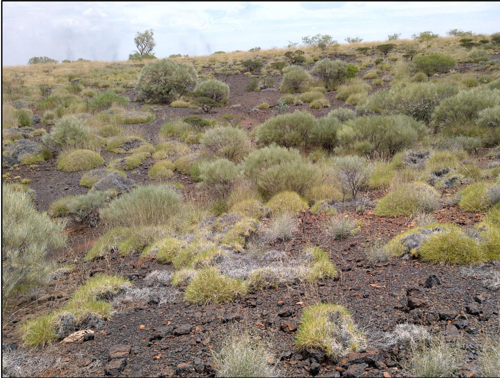
Figure 4. A gully from the northern manganese corridor exposing widespread manganese outcrop (looking south east). Refer to Figure 1 for the location