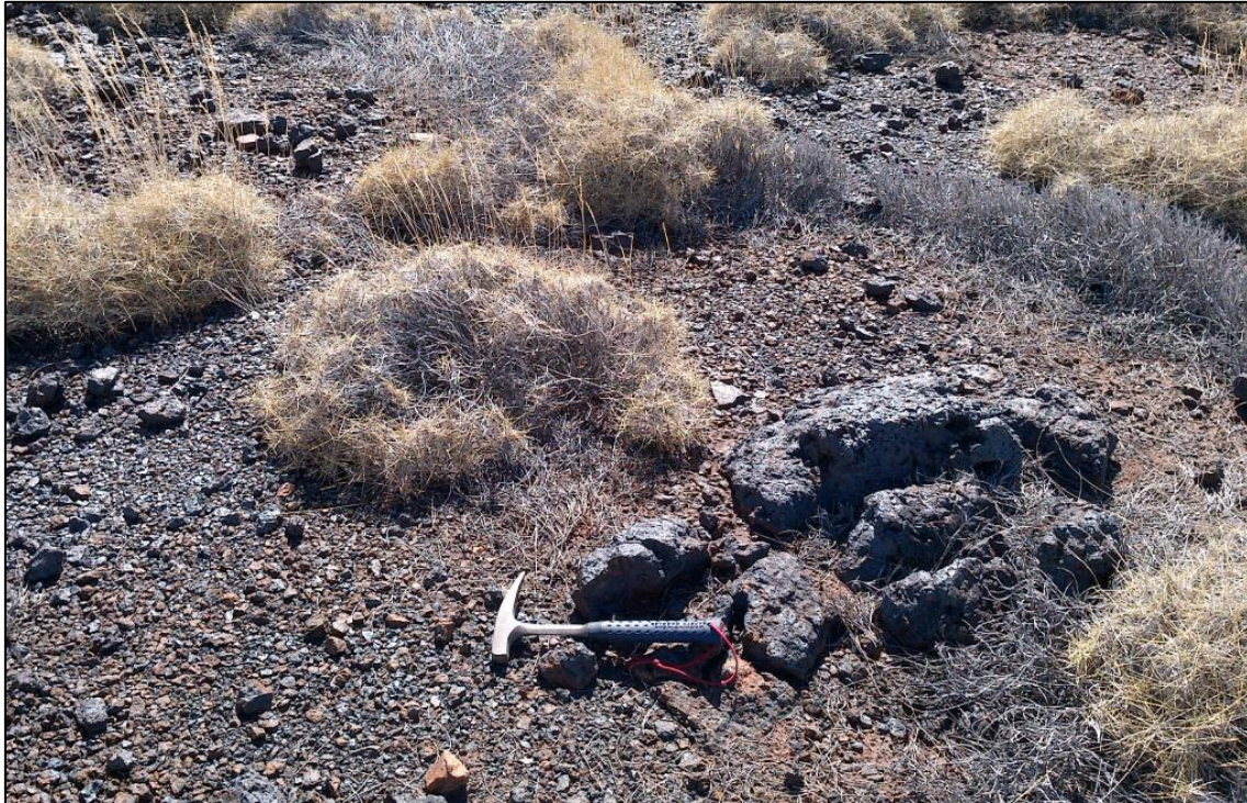
Figure 2. Outcrops associated with sample WDRC015 – 57.4% Mn (pXRF). Refer to Figure 1 for the location