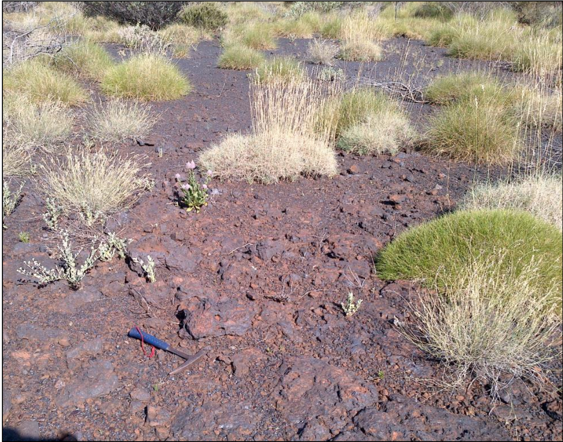
Figure 6. Outcrops associated with sample WDRC041 – 43.2% Mn (pXRF). Refer to Figure 1 for the location