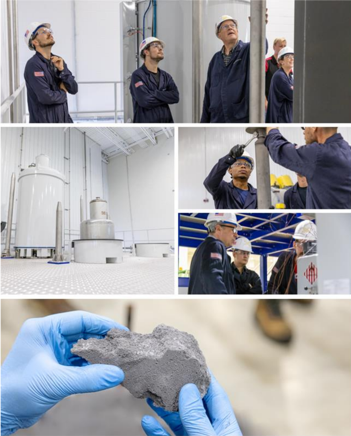
Figure 2: IperionX's HAMR furnace production cycle