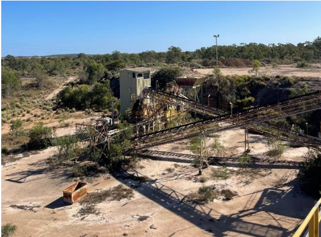
Figure 2a: Picture taken prior to NMR acquiring asset.