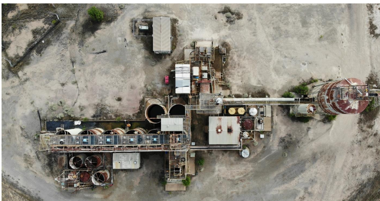
Figure 1b: Aerial view of BlackJack Processing Plant