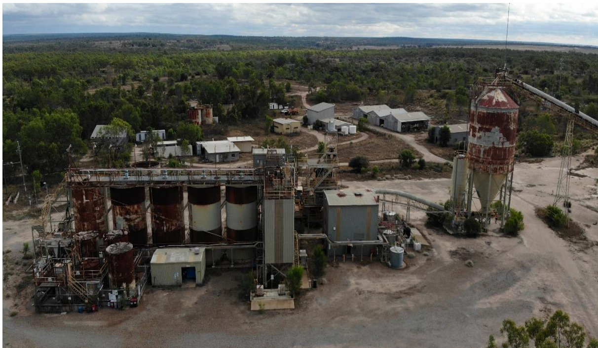
Figure 1a: BlackJack Processing Plant

Following NMR's recent acquisition, the Company has engaged engineers and consultants to perform a thorough assessment of the BlackJack Processing Plant, which is in better condition than initially anticipated. The Company is currently completing a detailed evaluation of key components, including performance testing and functional checks, to ensure they meet operational standards and are prepared for refurbishment, while on care and maintenance.