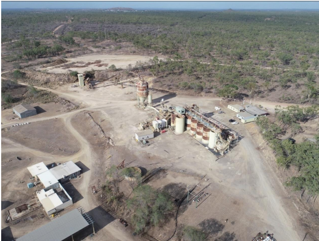
Figure 2b: Picture taken two weeks after announcement of NMR acquisition