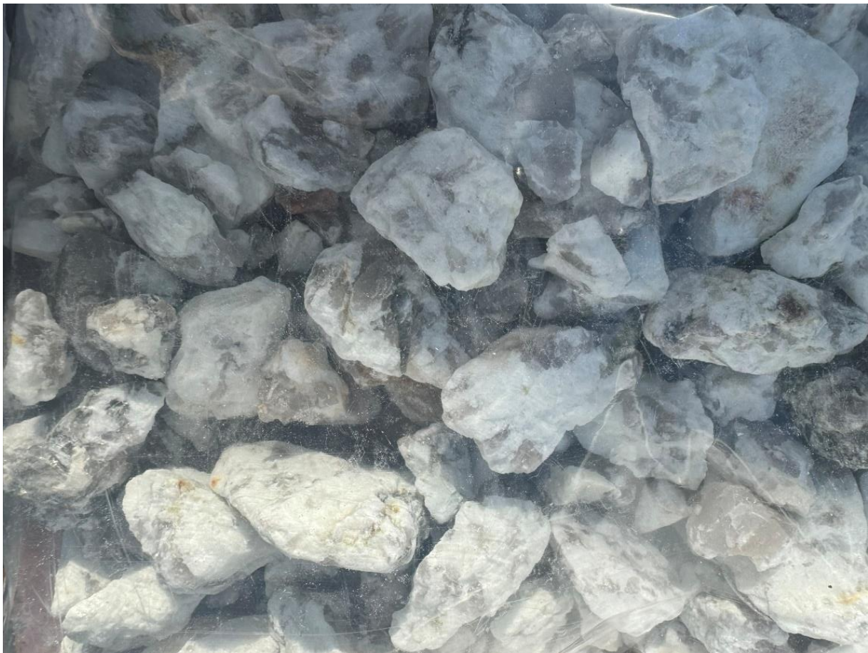
Plate 1: Pippingarra rock sample being tested by interested party

These results are preliminary in nature and subject to further refinement, validation, and verification. The Company emphasizes that the results disclosed herein should not be interpreted as definitive or indicative of economic viability at this stage. Further testwork is planned to bring the data in compliance with JORC 2012 standards, and updates will be provided in due course.