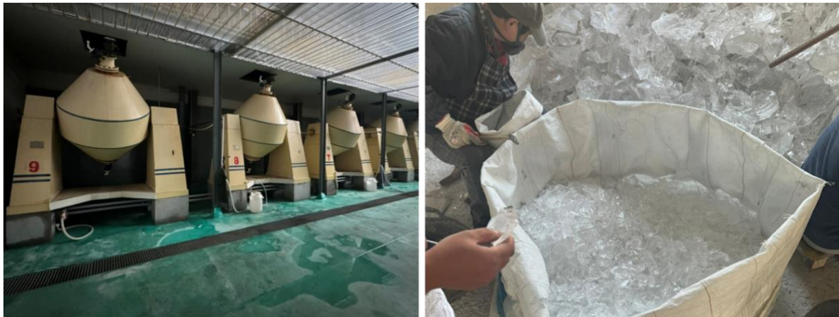
Plate 2: Left: Acid leach in newly commissioned HPQ factory visited in Lianyungang.

During the visit, a newly commissioned HPQ factory was also visited, with the owners expressing interest in testing IND's quartz material. While no agreement has been reached yet, this potential collaboration could open further avenues for product development and market expansion.