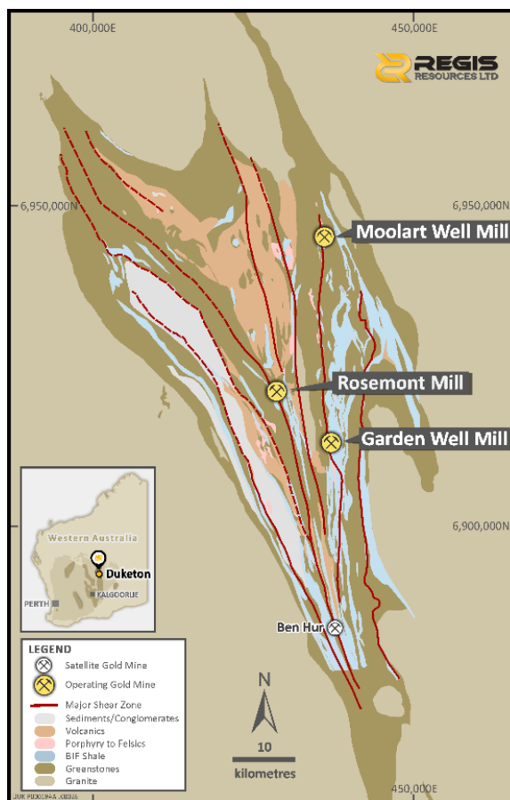
Figure 2: Ben Hur location within the Duketon Greenstone Belt

Drilling beneath the open pits has demonstrated the potential for mineralisation to continue down plunge which, if economic, could support the establishment of a fourth underground production source.