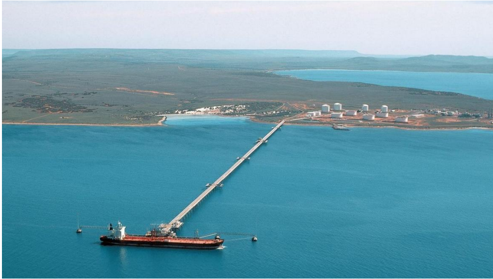
Figure 1: Port Bonython, South Australia