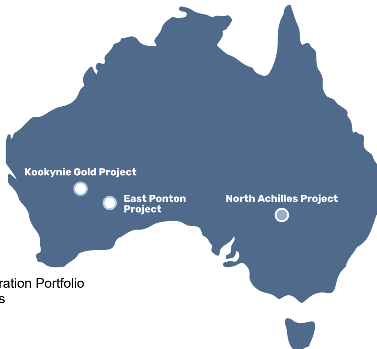
Figure A: Regener8 Exploration Portfolio Project Locations

Sitting within the Kookynie Gold district north of Kalgoorlie, the project hosts substantial historical workings and exploration with intersections including 2m @ 70.5 g/t Au (RC38), 2m @ 15.4 g/t Au (RC315) and 2m @ 11.32 g/t Au (RC391). Regener8's 2023 program found encouraging results which included 5m @ 3.18 g/t Au (NGRC017) and 2m @ 7.77g/t Au (including 1m @ 14.8 g/t Au in NGRC037).