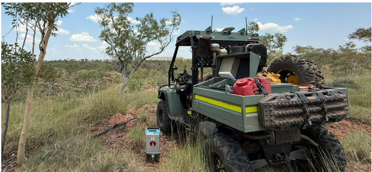
Photo 1: Blue Devil project gravity station data reading station in action.