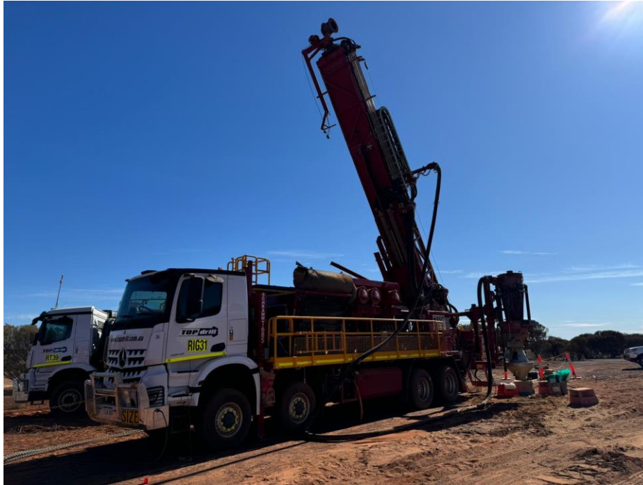
Figure 2 – RC Drill Rig at Whistler