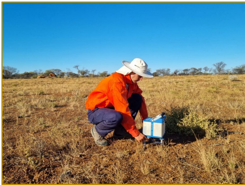
Figure 3. Geophysical Survey in progress at the Yallalong antimony project.