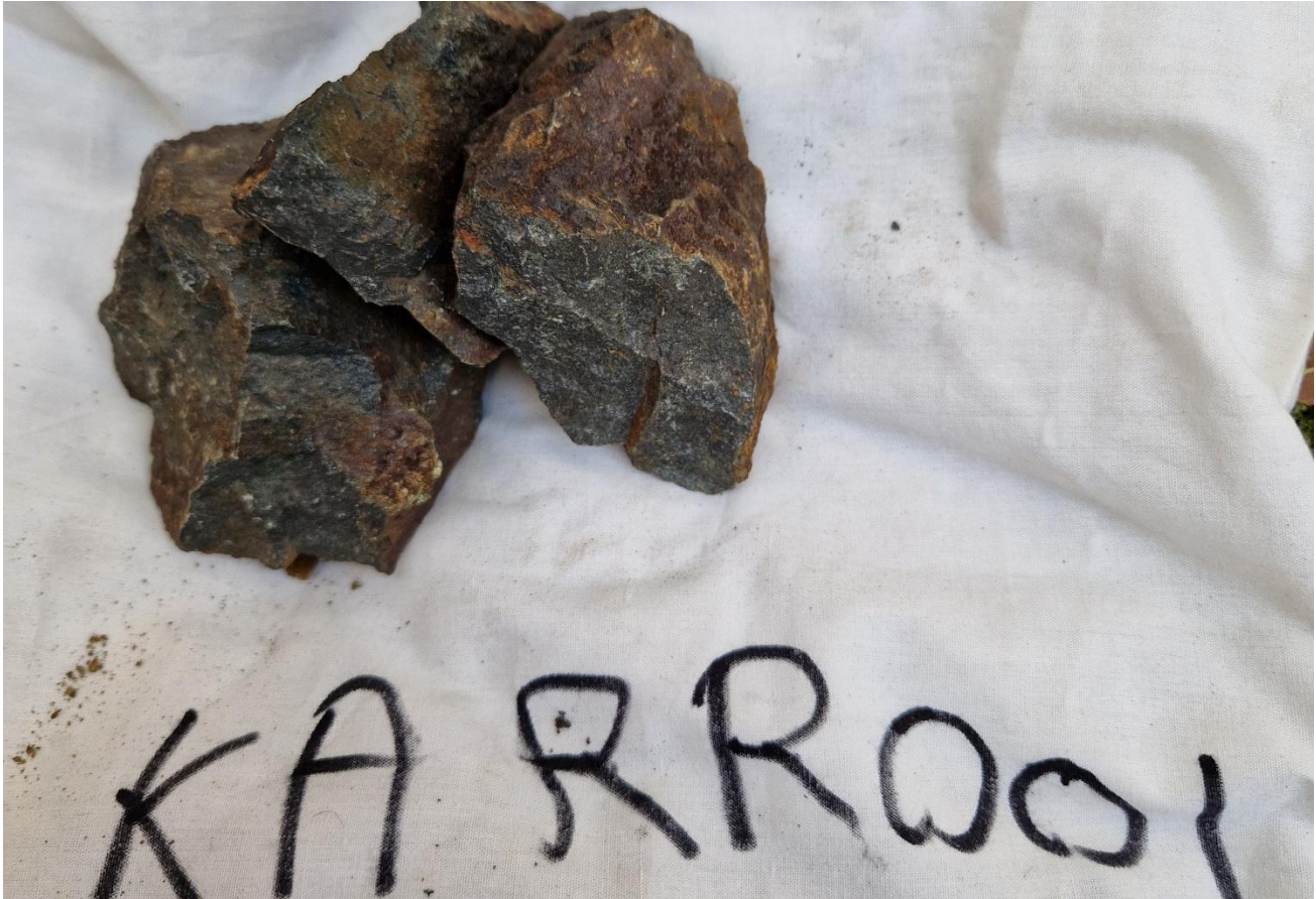
Figure 4: KARR001 sample 545982 East/6655296 North. Sweden SWEREF99 TM reference system and datum. Sample consists of actinolite-tremolite skarn (70%) +/- biotite (5%), magnetite (5%), with TREE + Y up to 16.93%. REE. The REE minerals are not identifiable and are disseminated and considered to be concordant with the foliation observed in the rock. % pXRF analyses and visual estimates are only indicative and should not be considered equivalent of laboratory analyses. Laboratory assays are expected later in November. Laboratory assays are expected in late November.