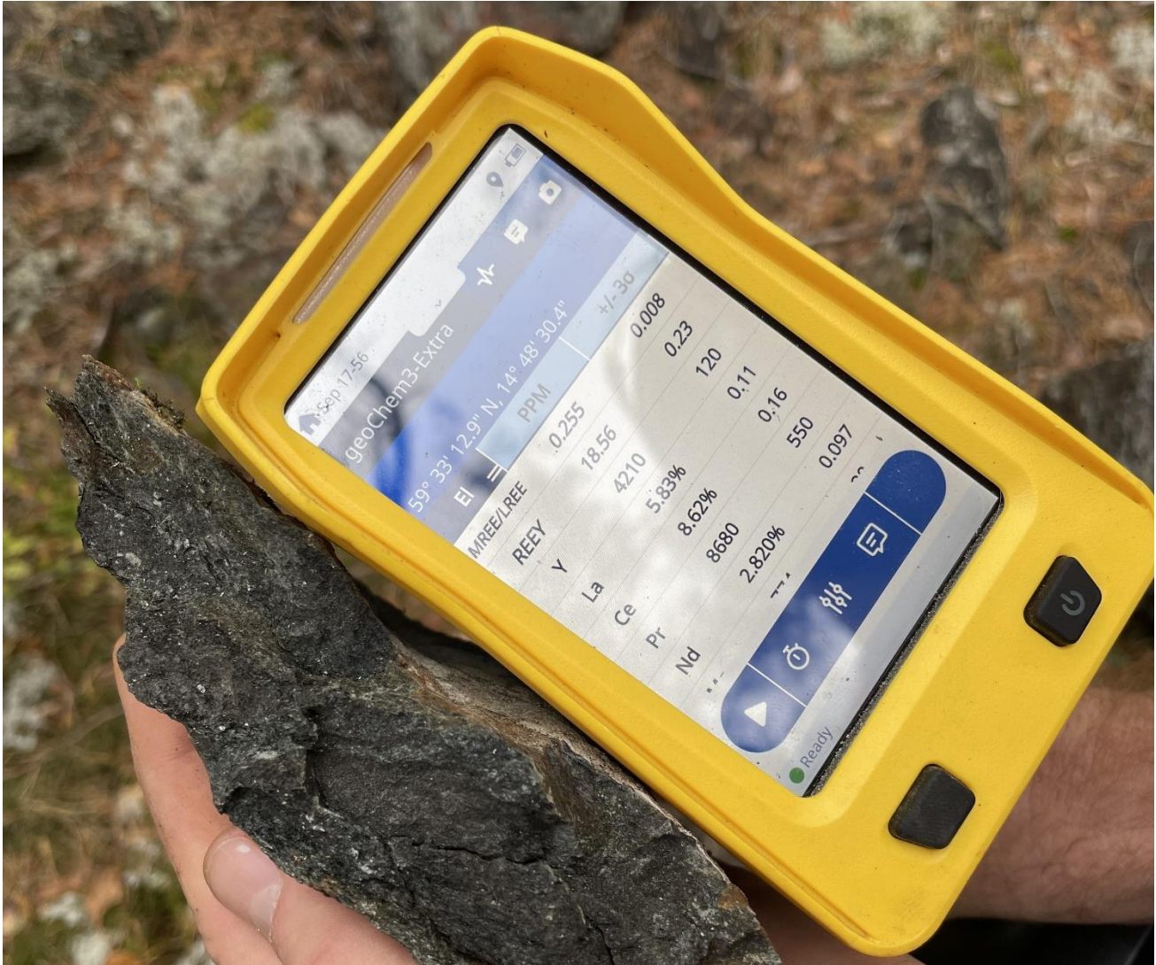
Figure 3: STRR001 sample with pXRF analysis. 489174 East/6601710 North. Sweden SWEREF99 TM reference system and datum. Sample consists of biotite skarn, which is schistose and massive (60% biotite), containing actinolite (15%) and magnetite (up to 5%). Up to 7 cm dull dark brown REE vein/lens (fine grained) along the foliation. REE mineralisation is present in patches or veins concordant with the foliation in the host rock. REE minerals cannot be distinguished specifically. TREE +Y elements are present to 18.56%. pXRF analyses and visual estimates are only indicative and should not be considered equivalent of laboratory analyses. Laboratory assays are expected in late November.