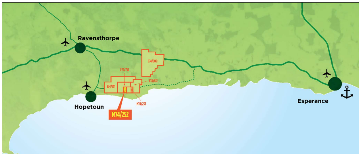
Figure 1: Location of the Springdale mining leases

Together, mining leases M74/0252 and M74/0253 – the granting of which was announced last week – cover nearly 100% of the existing mineral resources at the Springdale Graphite Project (refer Table1) 1 .