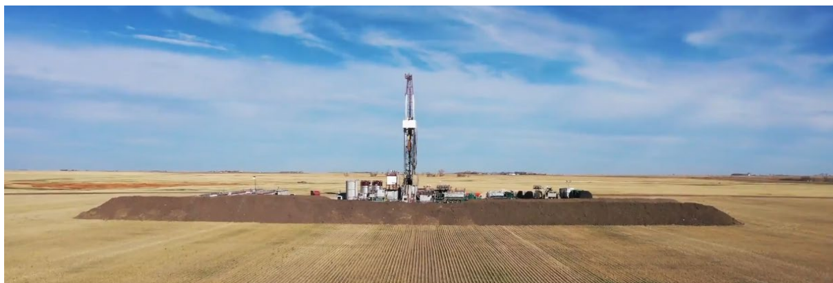
Figure 2: Drilling Rig at Pad #3