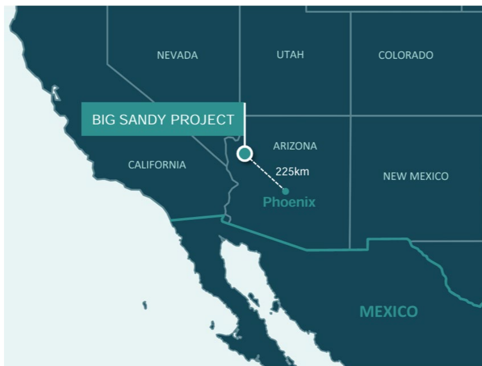
Figure 4 – Location of the Big Sandy Lithium Project, Arizona, USA.

The Company is in the process of evaluating in detail the implications of the court's decision and its next steps and will update the market as required.