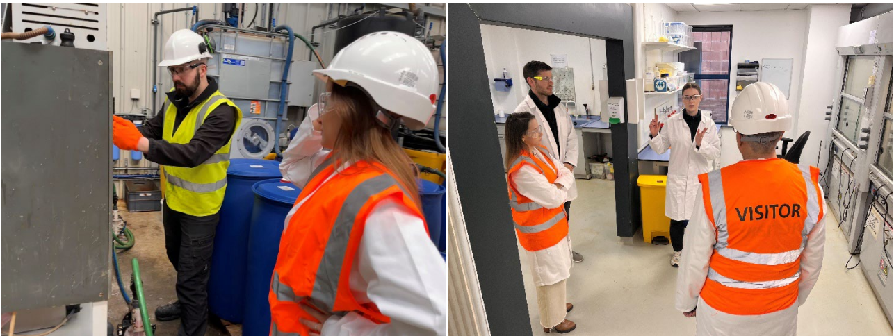
Figure 3: Invest Minas representatives inspecting Ionic Technologies' Belfast magnet recycling demonstration plant with an eye to replication in Brazil.