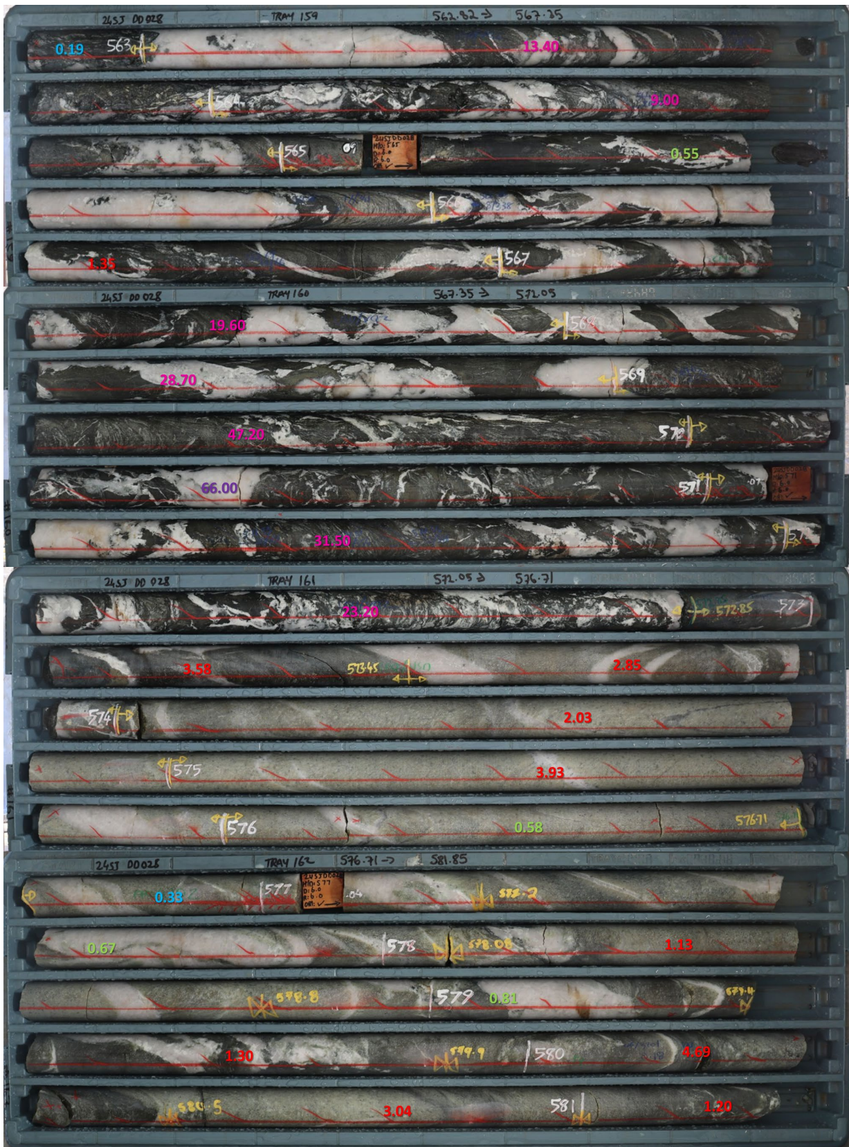
Figure 3 – South Junction Drill Hole 24SJDD028 showing the individual gold assay results (g/t) for the “Polar Star Lode” which returned 13.71m @ 18.02g/t Au from 563.00m (Refer to Appendix A for details).