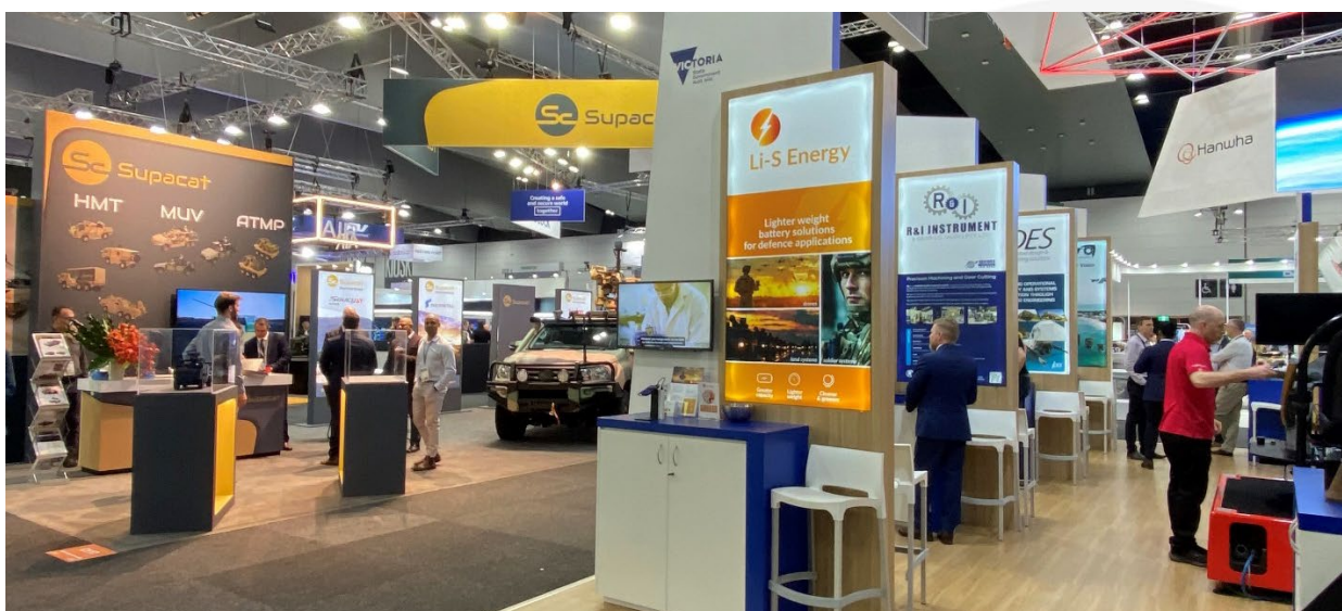
The LIS Energy pod, corner facing as part of the Invest Victoria Pavilion