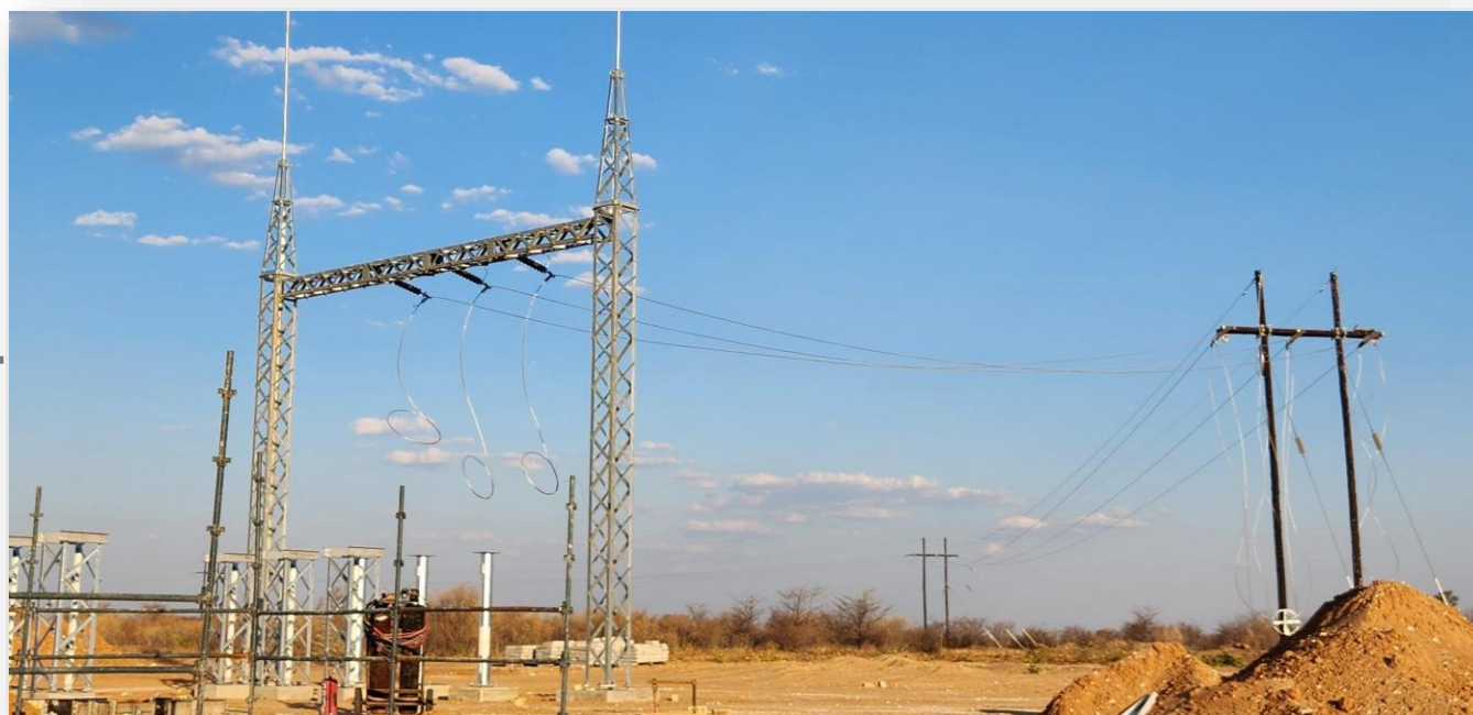
Lesedi Substation and Transmission Line connection

Botswana Power Corporation is supplying the first 5MVA transformer to Tlou. Future expansion will require Tlou to procure and install larger transformers, such as two 20MVA transformers, which would allow up to 25MW of power with some system redundancy.