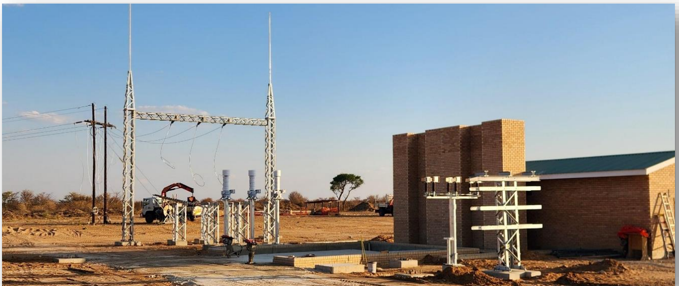
Lesedi Substation Construction – October 2024