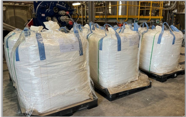
Alpha phase (LHS) and gamma phase (RHS) HPA orders ready for shipment from Stage 1