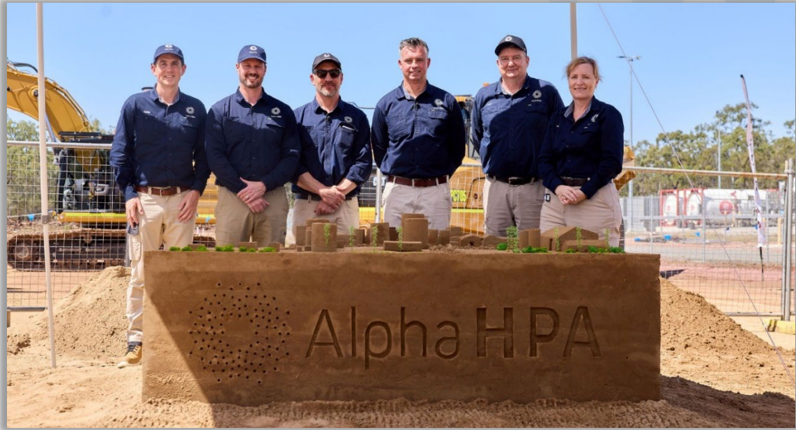
Alpha's senior executive team at the formal Stage 2 Groundbreaking ceremony.