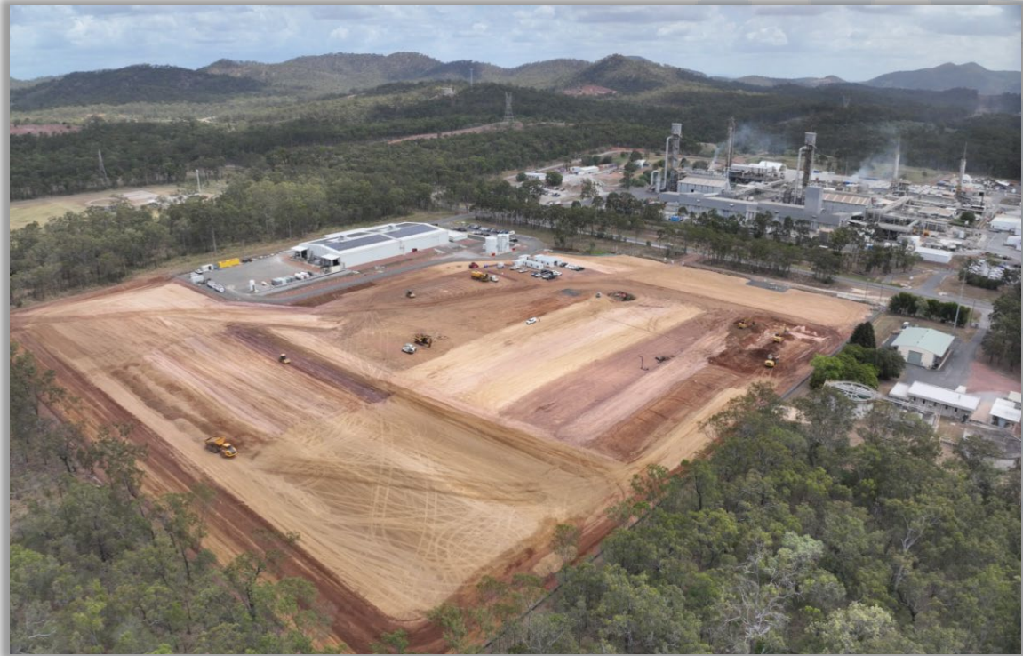
HPA First Project site showing earthworks well advanced, Stage 1 PPF and Orica Yarwun to the right of picture.