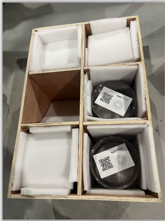
5 sapphire boules packed for shipping to sapphire optics buyer.

Additional sapphire boules are also being despatched for processing to synthetic sapphire wafers to service qualification enquiries for LED, semiconductor and sapphire optics end-users.