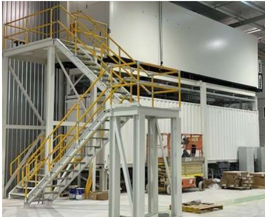
Figure 1: Classifiers MCC (upper level)