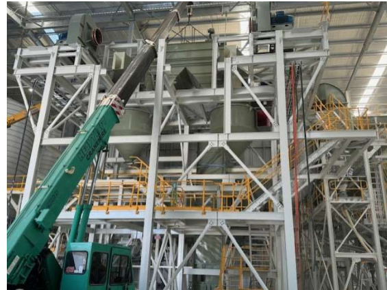
Figure 2: Classifiers installed ready for connection

WA Kaolin Ltd (“ WA Kaolin ” or the “ Company ”) ( ASX: WAK ) is pleased to provide an update on its activities for the September 2024 quarter.