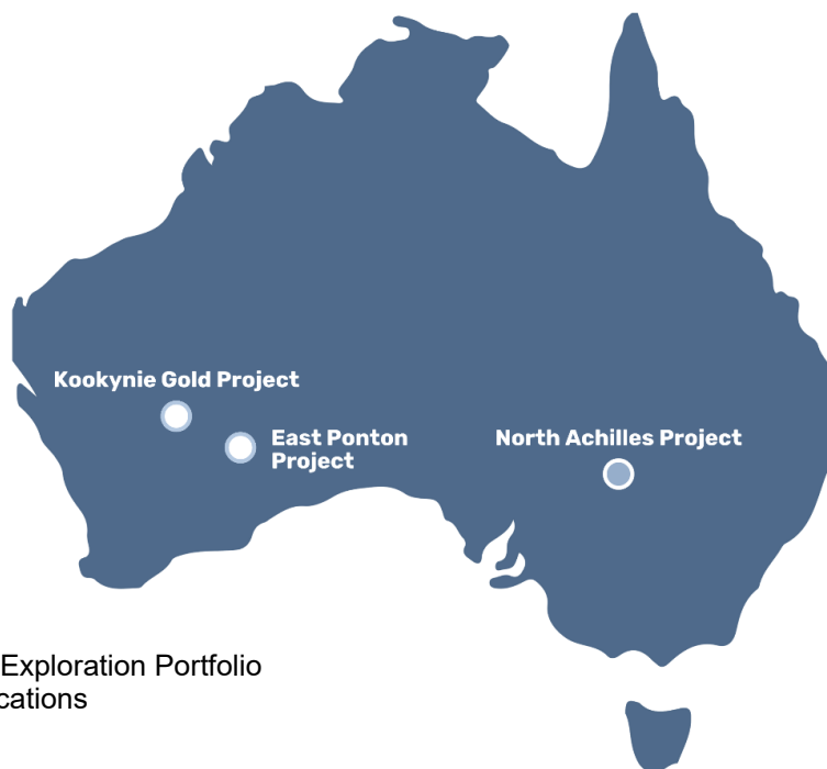
Figure A: Regener8 Exploration Portfolio Project Locations

The Company confirms that all material assumptions and technical parameters underpinning the exploration results in this report continue to apply and have not materially changed. The Company is not aware of any new information or data that materially affects the information included in this release.