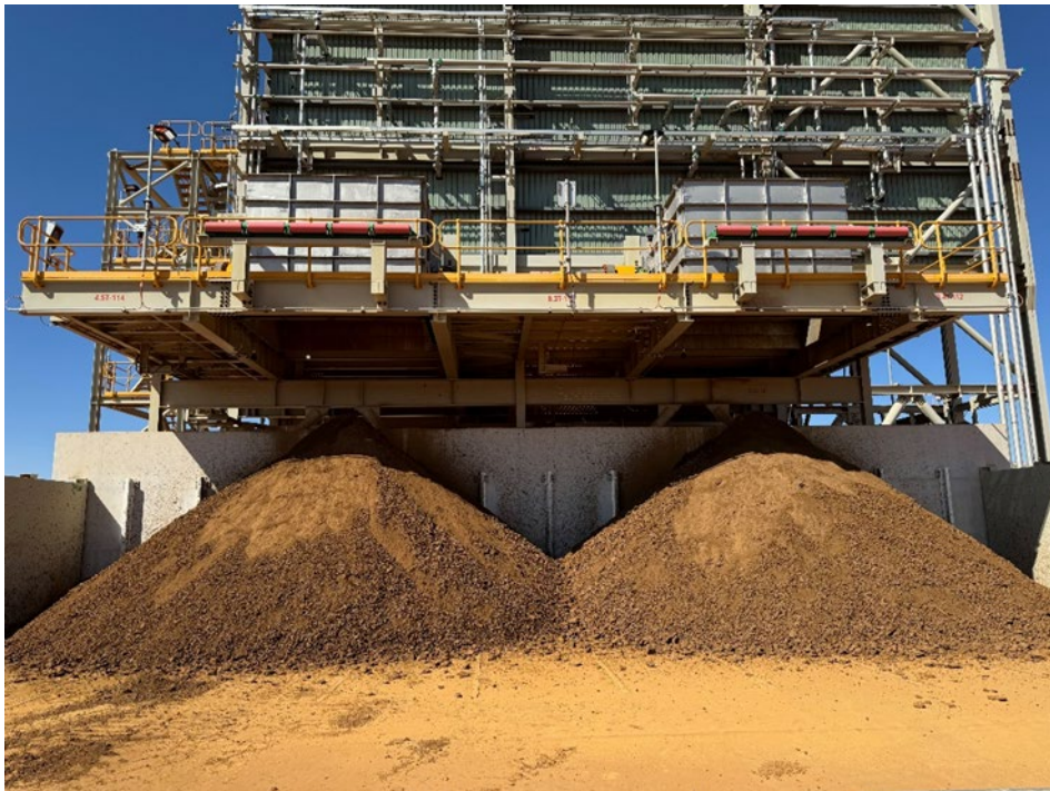
Concentrate Dewatering Circuit in Production

After signing the Power Purchasing Agreement with Zenith Energy in July 2024, the first stage of the Zenith Power Station has been commissioned and cutover from the existing power station to the Zenith power station is planned for the coming months. The hybrid power station has been designed to deliver up to approximately 70% average annual renewable energy as well as reliable baseload thermal capability.