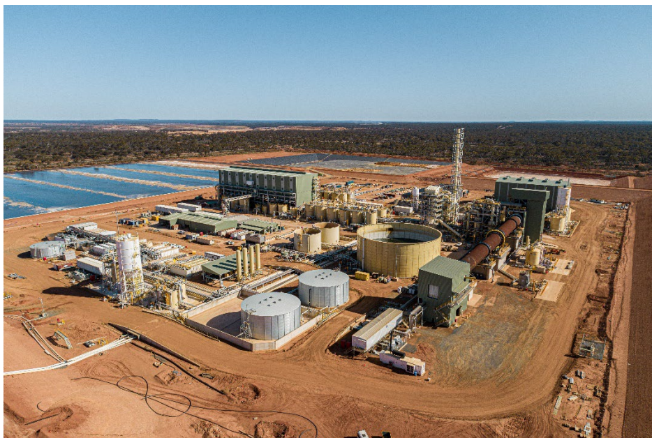
Lynas' Kalgoorlie Rare Earths Processing Facility

During the quarter deliveries of MREC from the Kalgoorlie Facility to Lynas Malaysia continued and the first batch of MREC from Kalgoorlie was processed at the Lynas Malaysia plant in the September quarter.