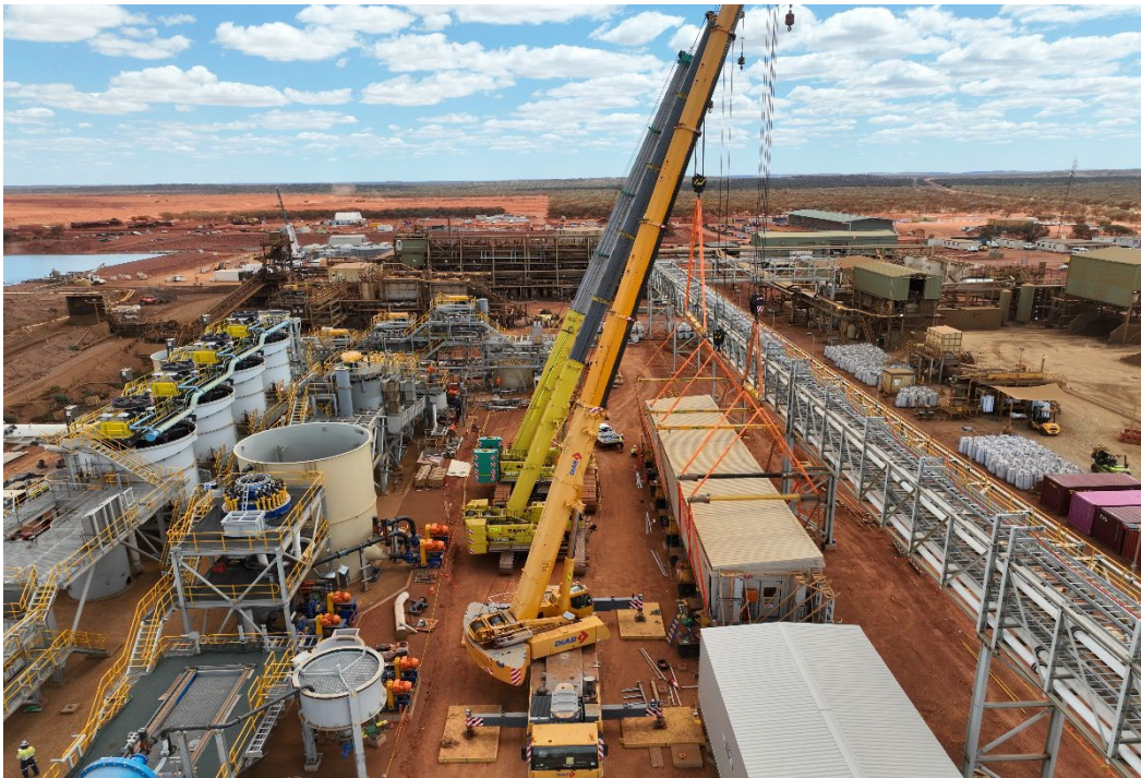
Mt Weld Expansion Project