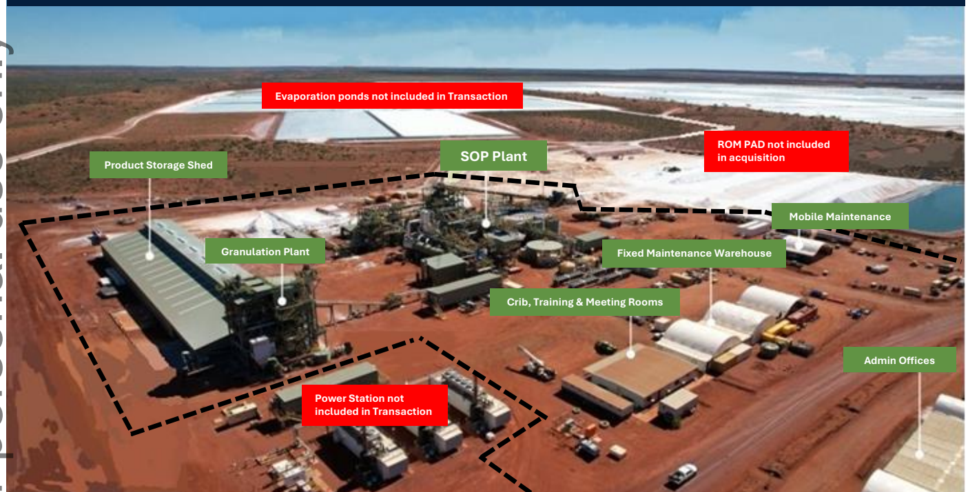
Figure 1 – Photograph of the Beyondie Potash Project in 2023 when in operation by Kalium. The Transaction comprises a fully constructed processing plant, site offices and maintenance infrastructure. Specific plant components include, KTMS crushing circuit, Kainite conversion circuit, column flotation circuit, liquor cooling heat exchangers, evaporative cooling circuit, product separation centrifuges, SOP recovery and granulation units, RO water plant and a bulk storage shed.