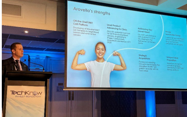
TechKnow Invest Roadshow in Sydney