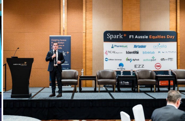
Spark Plus Australian Equities Day in Singapore