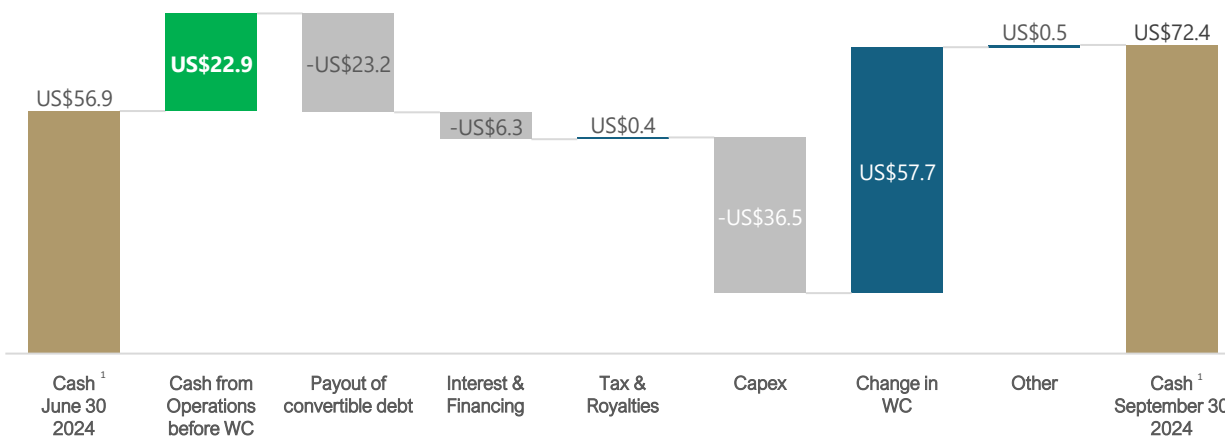
Figure 2 – Cash change details from June 30th, 2024, to September 30th, 2024 (US$M).

The Company ended the September quarter with a cash and cash equivalent balance of US$72.4M (up US$15.5M from the June quarter). The major cash movements included the Convertible Note debt repayment of US$23.2M and US$36.5M capital expenditure, which was mostly capitalised waste stripping at Point Lake (US$24.2M) and the purchase of two new road haul trains (US$2.4M). Change in working capital was primarily due to US$50.9M arising from change in inventory, US$3.4M change in receivables due to a GST refund received during the quarter, and US$2.0M due to change in trade and other payable. Exploration expenditure for the quarter totalled US$3.4M. The Company did not make any payments related to the environmental bonds during the quarter pending the establishment of an environmental trust account with tax deduction advantages.