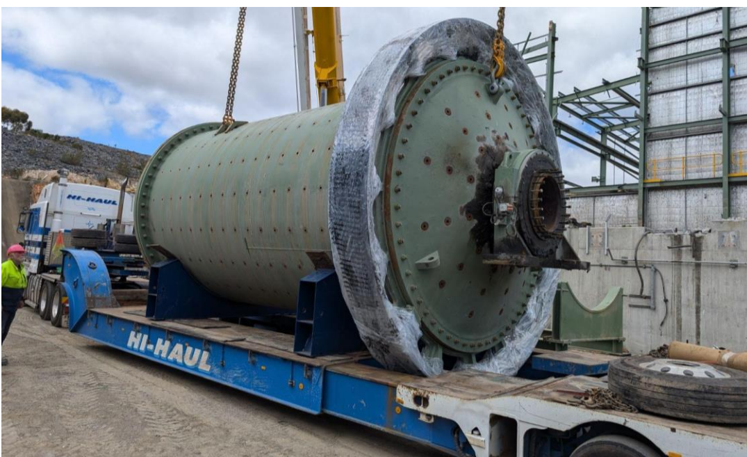
Figure 3: The 750kW ball mill being loaded for transport to the Murchison.