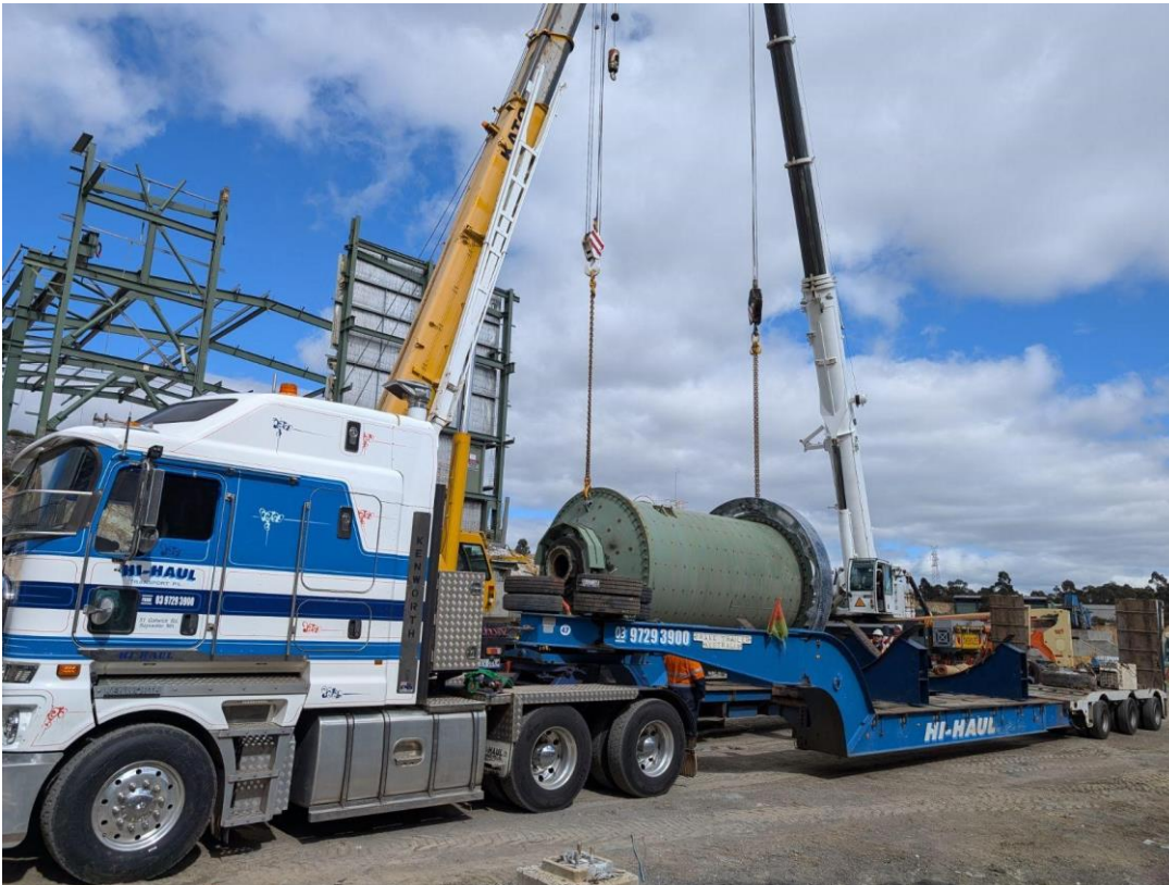
Figure 2: The 750kW ball mill being loaded for transport to the Murchison.