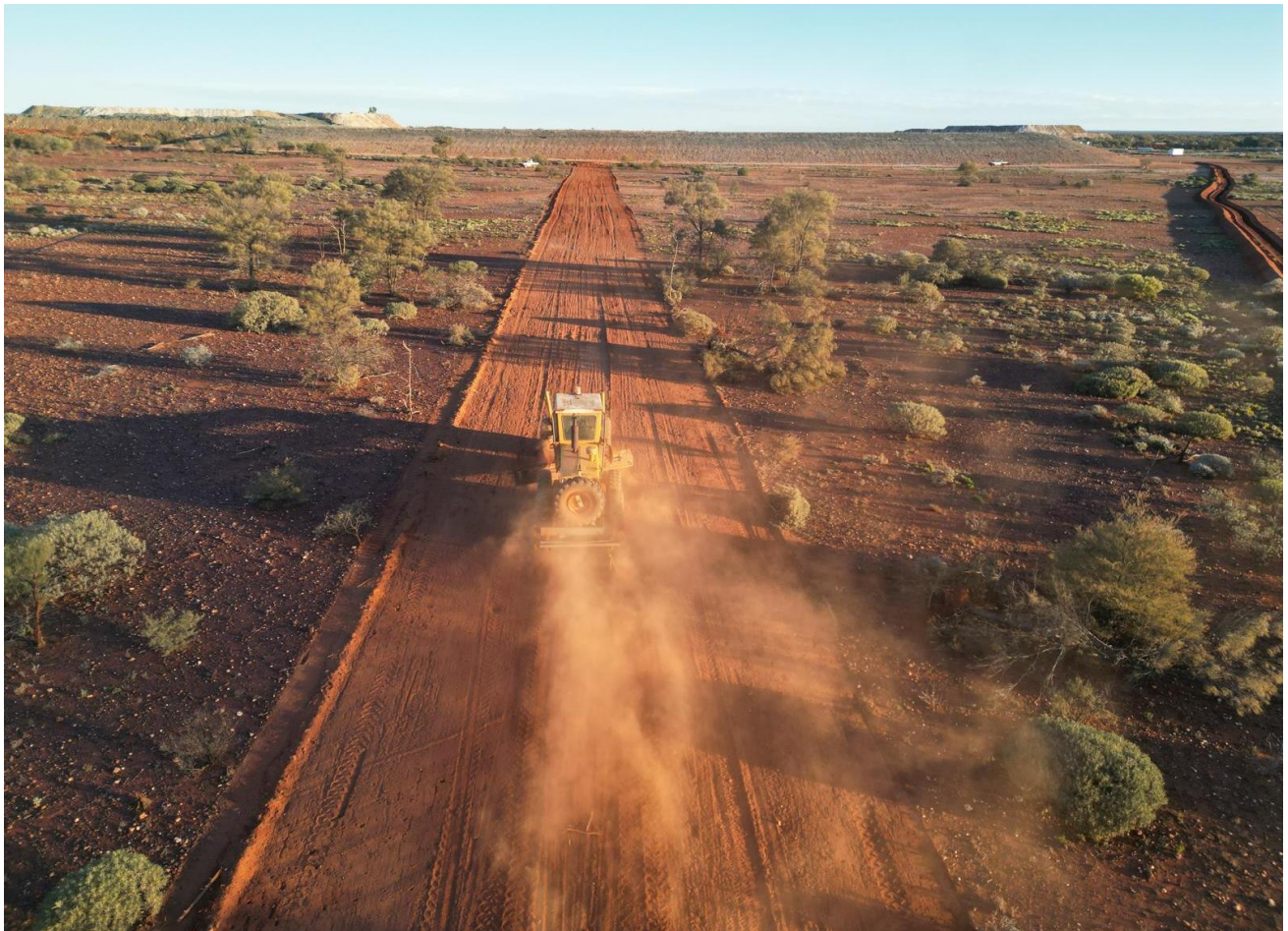
Figure 1: Haul road construction underway, July 2024.

In July approval of the mine dewatering and clearing permits for the new open pit mining area was received ( ASX announcement, 8 Jul 2024 ). In September the final approval required for development of the Murchison, the open pit Mining Proposal, was received ( ASX announcement, 4 Sept 2024 ). The Company immediately commenced construction of the accommodation village, administration infrastructure and haul road between the processing plant and the open pit mining area, allowing open pit development work to commence in advance of mining in early 2025.