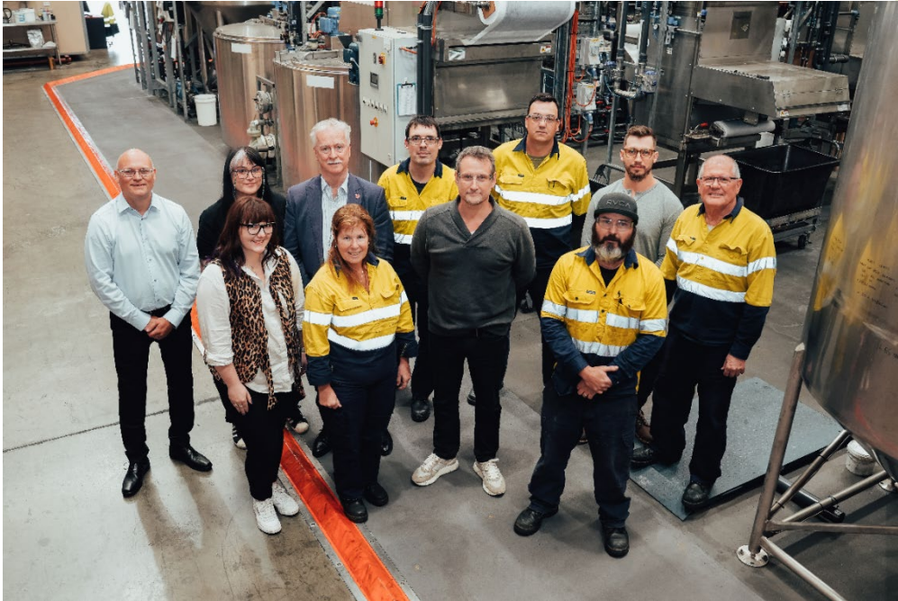
Figure 3: First Graphene's UK-based team visited the Henderson facility in September.

First Graphene's UK-based team visited Australia during the quarter as work commenced on the HyPstore project, which is valued at more than A$3.7 million.