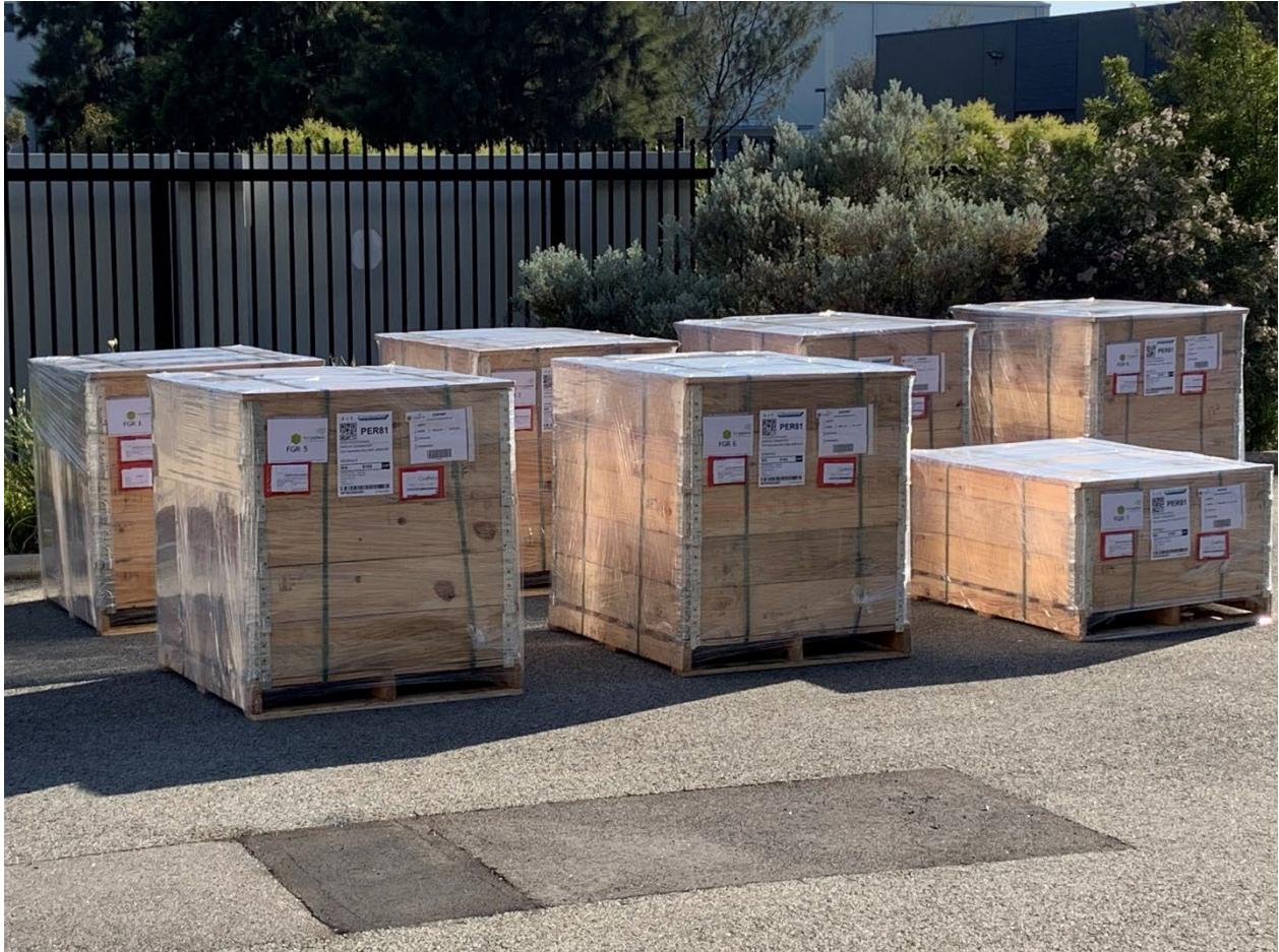
Figure 1: PureGRAPH-CEM® ready for shipment ahead of third trial with Breedon Group

The Company transported more than three tonnes of PureGRAPH-CEM® during the quarter for testing under full-scale cement production conditions at Breedon’s Hope Cement Works facility.