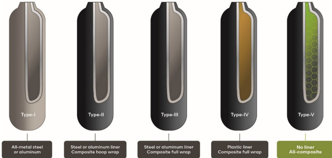
Figure 4: Five common pressure vessel types including the Type-V tank.

By leveraging the unique properties of graphene, the enhanced tanks can reduce hydrogen permeability by up to 48-times, as well as increase strength of the protective barrier created inside the tank.