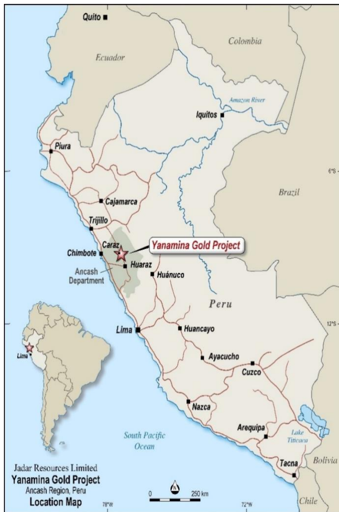
Figure 1: Regional Location

The Yanamina gold project is held through 5 mining concessions, Malu I, II, III, Monica T and Gladys E, with a total area of 918.66 hectares. The main concession, Malu I, which covers the Yanamina resource, has an area of 224 hectares and lies within the “buffer zone” adjacent to and around the Huascarán National Park.