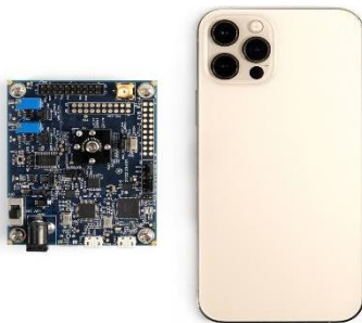
(Figure 1, iPhone used as size reference)

The new, smaller evaluation board (Figure 1) introduces interface support for connecting to a wide range of external components (ECP), while maintaining the same features as the original. Its compact and flexible form factor allows developers to seamlessly integrate sensors and manage chip-to-chip communication, all within a significantly more portable design. This streamlined evaluation board is ideal for developers because it provides the same high-level capabilities as the original while enhancing rapid prototyping and evaluation through its ease of use and portability.