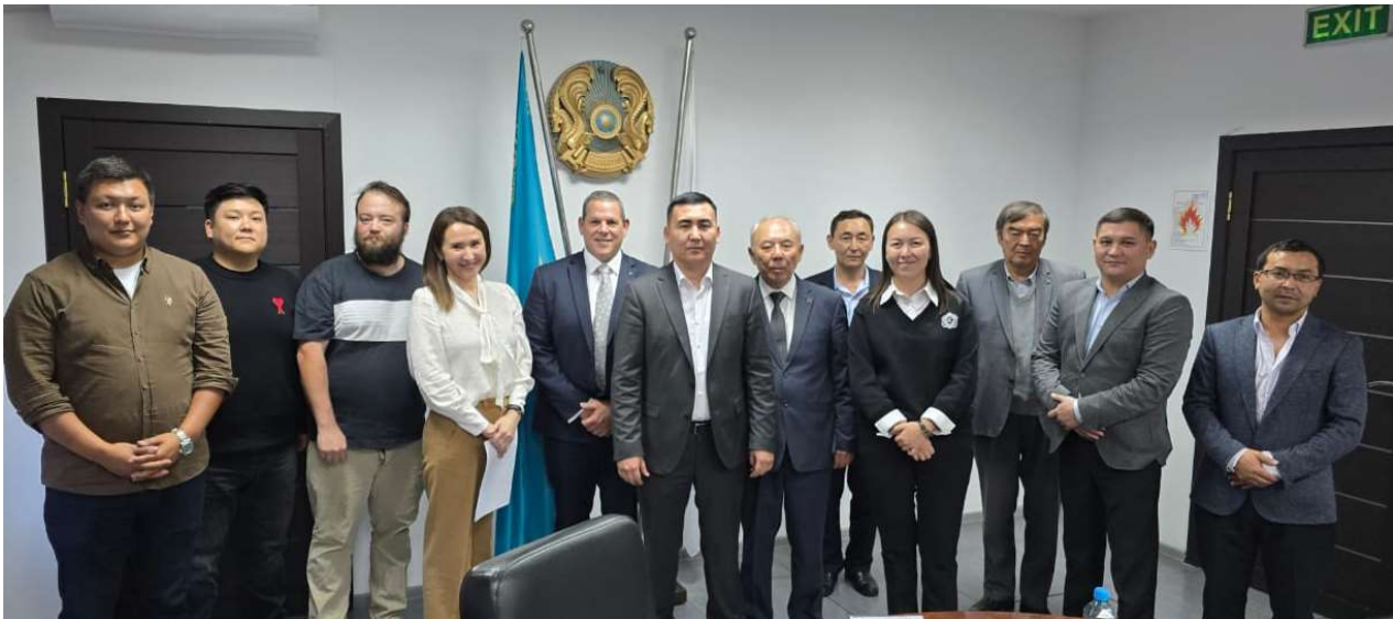
Figure 1: C29 Metals & Volkov Geology MOU Signing Ceremony

“This is a significant milestone for the company to have Volkov Geology join us as our geological partner is quite simply an incredible step forward as we rapidly advance towards our stated goal of becoming a globally significant Uranium development company.”